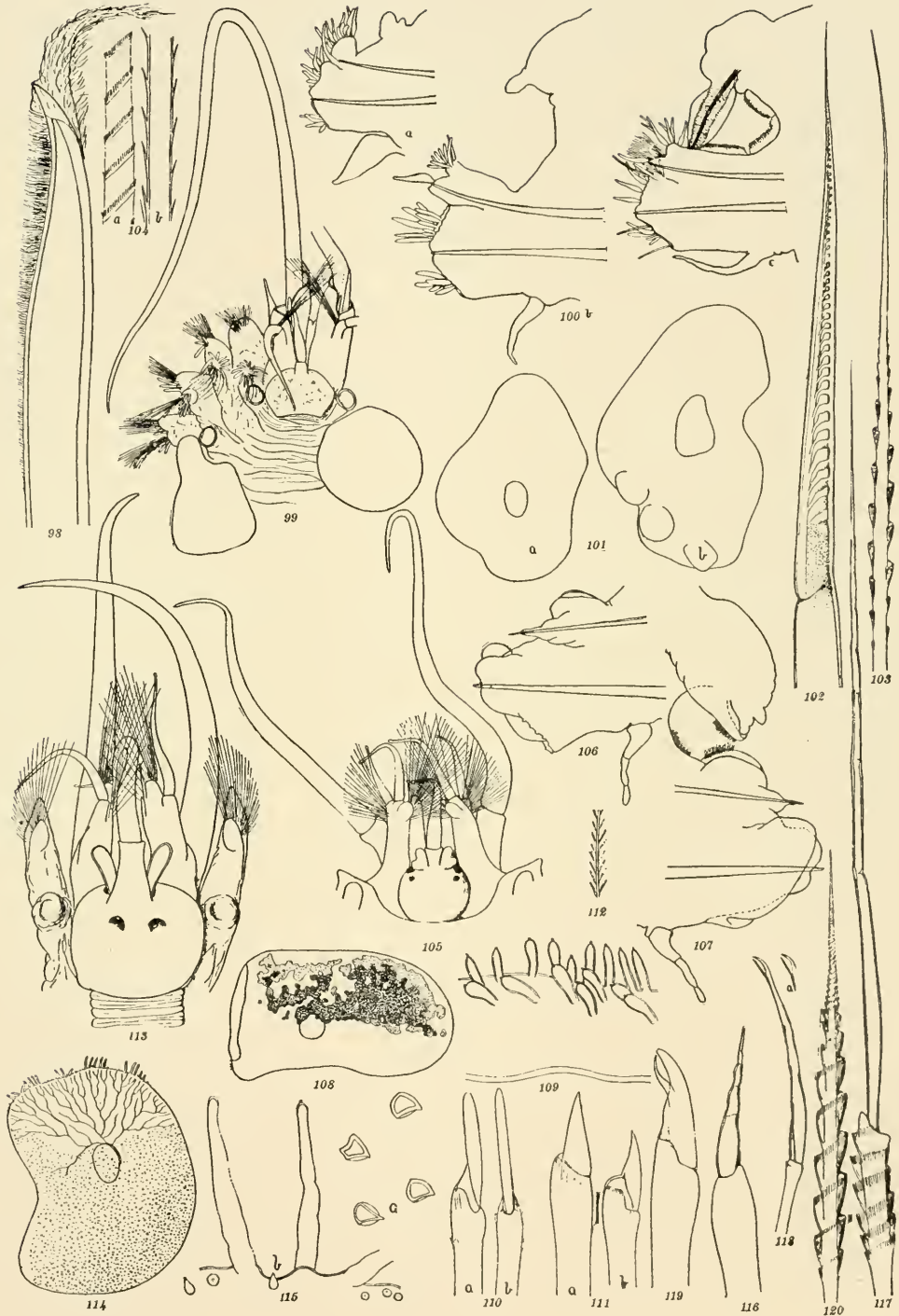
MOORE: POLYCHÆTOUS ANNELIDS.