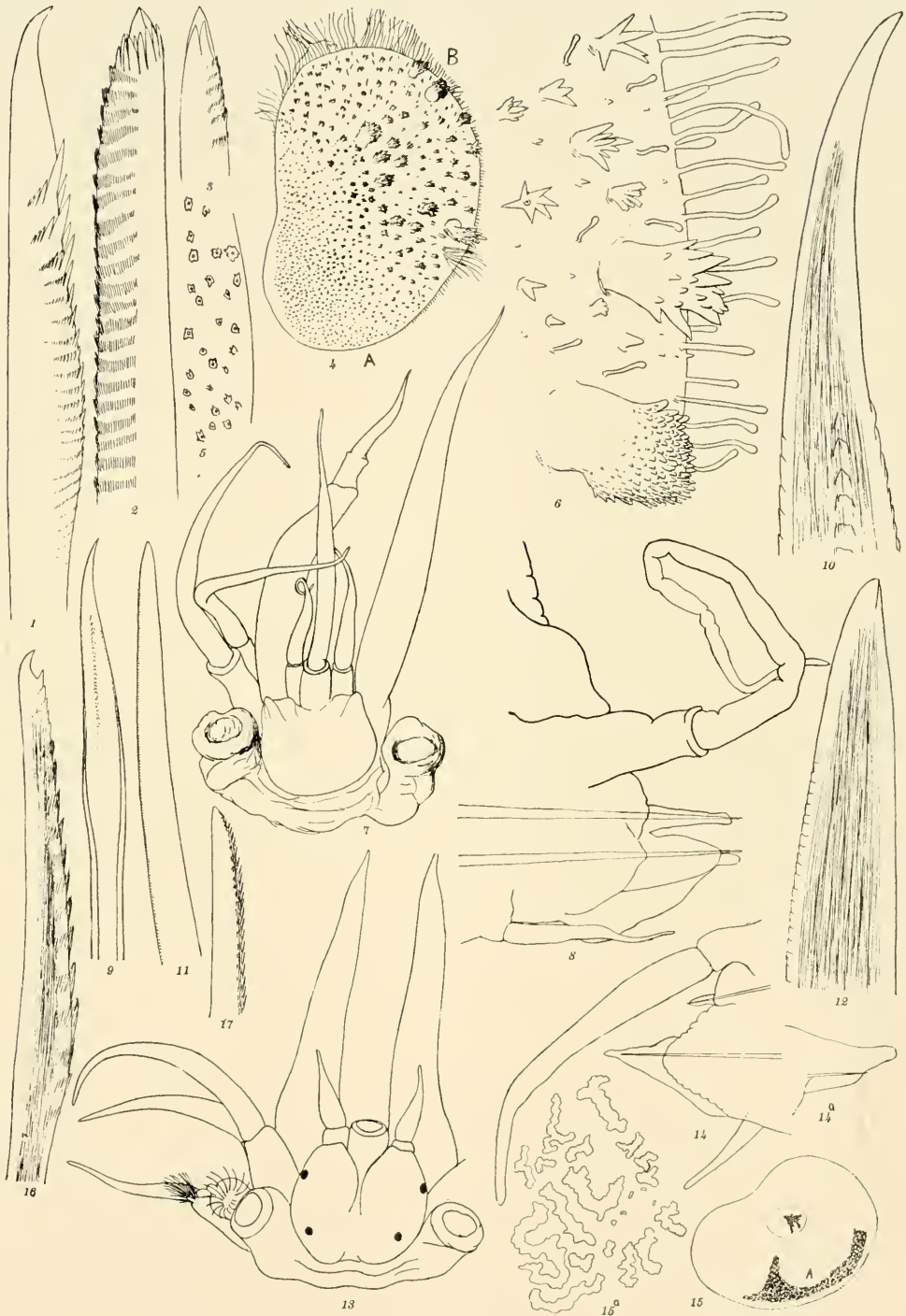
MOORE: POLYCHÆTOUS ANNELIDS.