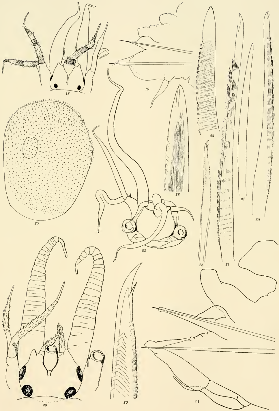
MOORE: POLYCHÆTOUS ANNELIDS.