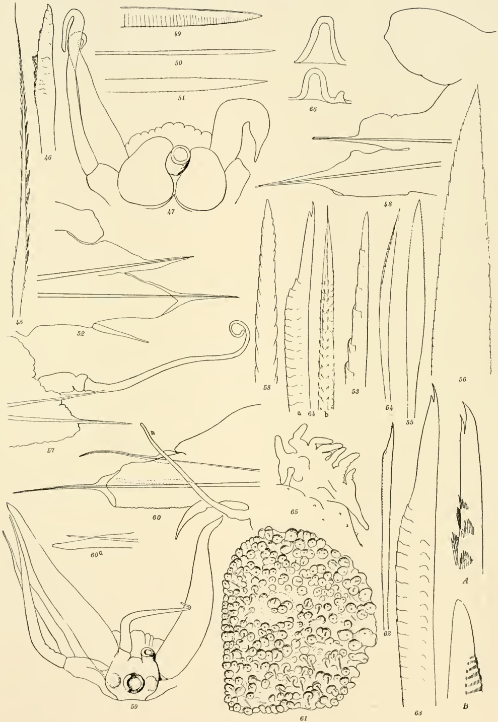
MOORE: POLYCHÆTOUS ANNELIDS