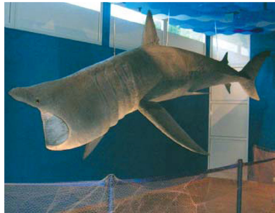
Display at the marine biology museum 'Pietro Parenzan'.

scientific high schools are driven towards such topics by their curricula (or by their inclination). Only 5% of answers demonstrated knowledge of plankton, describing it as the organisms that live in suspension in the water column, some being able to move by their own means but being unable to swim against currents. Primary-school children were also more informed on this topic than middle- and high-school students, again with the