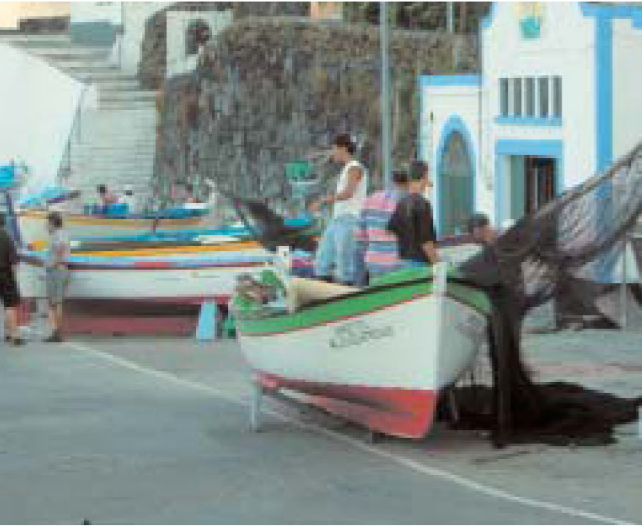
Present-day uses of the oceans: fishermen from the Azores.

As this is a groundbreaking study, the centres also devise and run educational programmes to train graduate students in the multidisciplinary methods of ecological, historical and paleo-ecological research. Each summer, one of the centres holds an intensive two-week international summer school. The University of Southern Denmark hosted the 2001 summer school, attended by 25 students from eight countries. In 2002, the participation of 33 students from 10 countries in the University of New Hampshire's summer school showed the growing interest in this type of work.