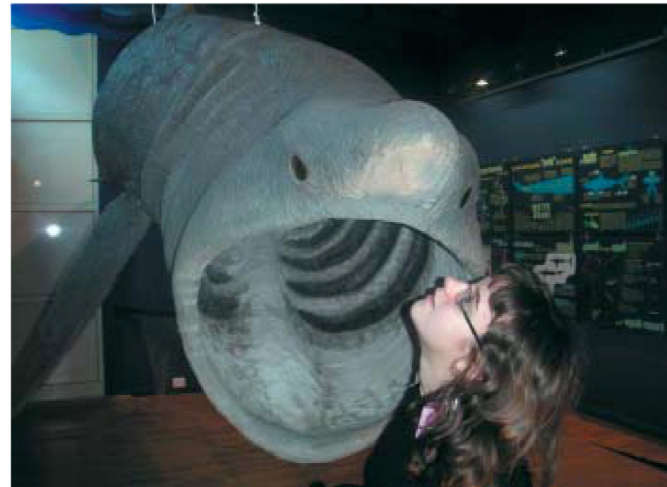
School students learn about basking sharks.

higher percentage of primary-school students (61.3%) than middle-school (44.4%) and high-school (50.7%) students. Interest in marine filter-feeders was very high among primary- and middle-school students (more than 90%), whereas it was much lower for high-school students, with scientific high school being the only exception. This shows a decrease of interest in such topics among older students, and suggests that only students of