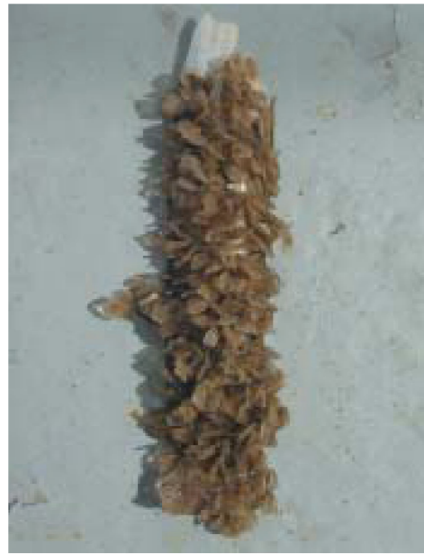
Razor-shell covered by egg capsules of dog whelks.

incrassatus ) and that all species historically reported as N. reticulatus actually were N. nitidus .