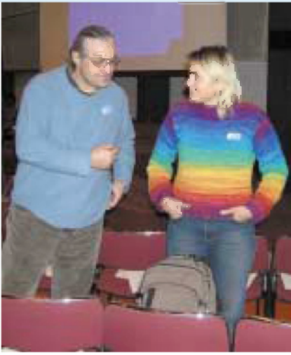
Participants at the OBI conference.

NoE and directly through support of participants, and by the World Data Centre for Oceanography in Silver Spring, Maryland, US.