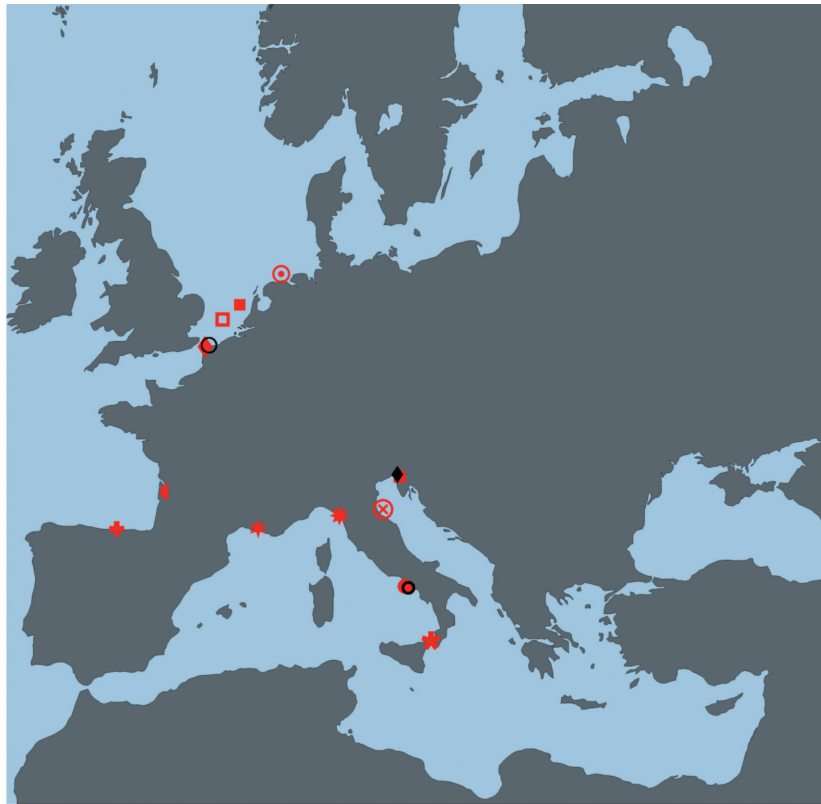
Fig. 1: European distribution of the invasive calanoid copepod Pseudodiaptomus marinus . ○: Gravelines (France) (Brylinski et al. , 2012); ◆: Calais (France) (Brylinski et al. , 2012); ◐: Bay of Biscay (France) (Brylinski et al. , 2012); ◑ and ◒: Southern North Sea (Jha et al. , 2013); ◓: North Sea (German exclusive economic zone) (Jha et al. , 2013); ⊗: Rimini (Italy) (De Olazabal and Tirelli, 2011); ◔: Monfalcone (Italy) (De Olazabal & Tirelli, 2011); ★: Berre Lagoon (France) (Delpy et al. , 2012); ☆: Lake Faro and Lake Ganzirri (Italy) (present work); ●: Gulf of Naples (Italy) (two sites: St. LTER-MC and an offshore sampling site) (present work); ●: Lake Fusaro (Italy) (present work); ○: Marina di Carrara (Italy) (present work); ◼: Gulf of Trieste (Italy) (St. LTER-C1); +: Bilbao (Spain) (present work). Coastline data: NOAA National Geophysical Data Center, Coastline extracted: WLC (World Coast Line), Date Retrieved: 08 January, 2013, http://www.ngdc.noaa.gov/mgg/shorelines/shorelines.html .

(northeastern Adriatic) in May 2009 (De Olazabal & Tirelli, 2011) (Fig 1). Afterwards, it was not possible to assess whether the species had successfully survived in the area as no more samplings in the same area have been performed. In this case, it was hypothesized that P. marinus had arrived more likely through aquaculture rather than ballast waters (De Olazabal & Tirelli, 2011). At that time, P. marinus had not yet been recorded in the nearby St. LTER-C1 in the Gulf of Trieste (as discussed in De Olazabal & Tirelli, 2011). Later on, the species has been found in several other Adriatic coastal sites between 2011 and 2013, as well as at station LTER-C1 in the Gulf of Trieste (Tirelli, personal communication).