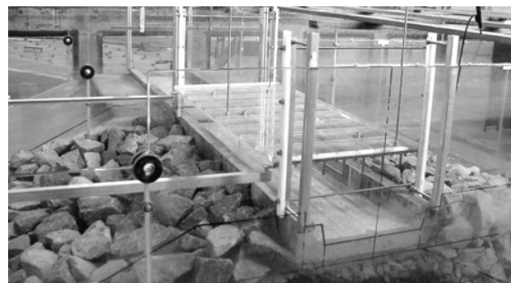
Figure 2 : scale model set-up (1/20).

These time series are converted to actual wave loading on the model by using a numerical model for the dynamic response of the scale model, thus taking into account the dynamic characteristics of the scale model. Doing so a numerical filter is derived to eliminate possible natural frequencies due to the characteristics of the model set-up. Measured time series of the reaction forces are used as input for the numerical model. Eventually the design values for the wave impact loading in prototype are derived using Froude scaling ( 1/8000 = 1/20^3 ).