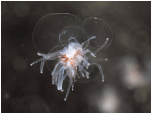
Fig. 3. Detached single cormidium of Apolemia uvaria (see Figure 4 below for interpretive drawing) Stoke Point, South Devon. Diameter of cormidial cluster <5 mm.

sting to the prey. In the single cormidium shown in Figure 3, the tentacles are withdrawn between the palpons (so not visible), but in other cormidia (images available from the authors) tentacles like that illustrated in Figure 4C are visible.