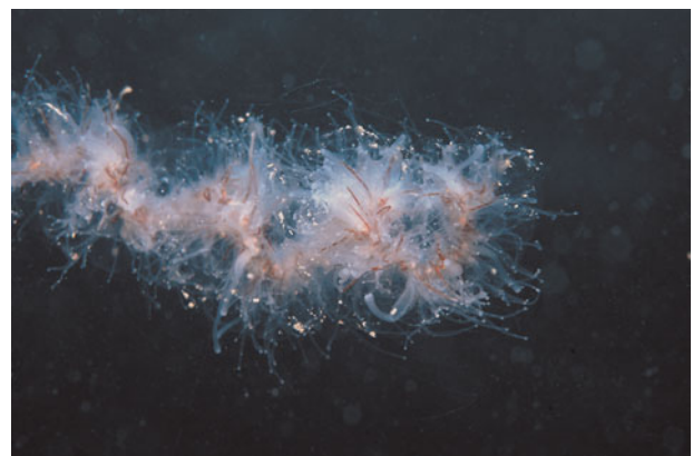
Fig. 2. Part of a siphosomal fragment of Apolemia uvaria showing several cormidia with gastrozoids, many translucent palpons and some shorter red palpons. Hand Deepes, offshore south Cornwall. Diameter of cormidial clusters <5 mm.

In whole unfragmented apolemiid colonies, many elongate tentacles emerge from the siphosomal stem, one from each gastrozoid or palpon. When feeding these hang down some distance (Mapstone 2003, figure 14), exposing a row of stinging cells (nematocysts), which inflict a painful and often lethal