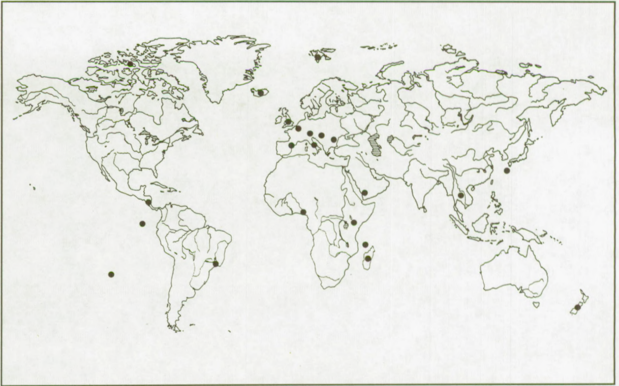
Map 5. L. arcuata (Bryce)