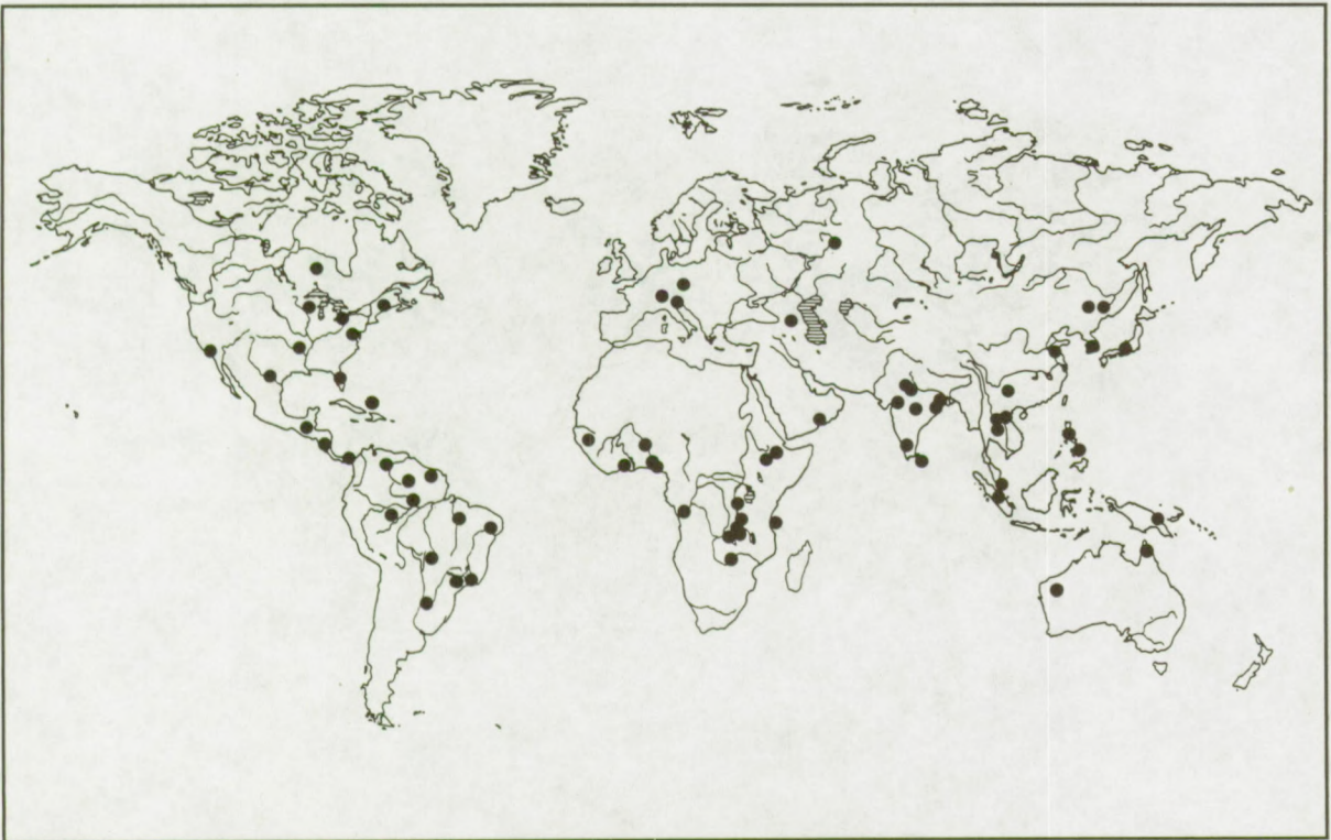
Map 16. L. curvicornis (Murray)