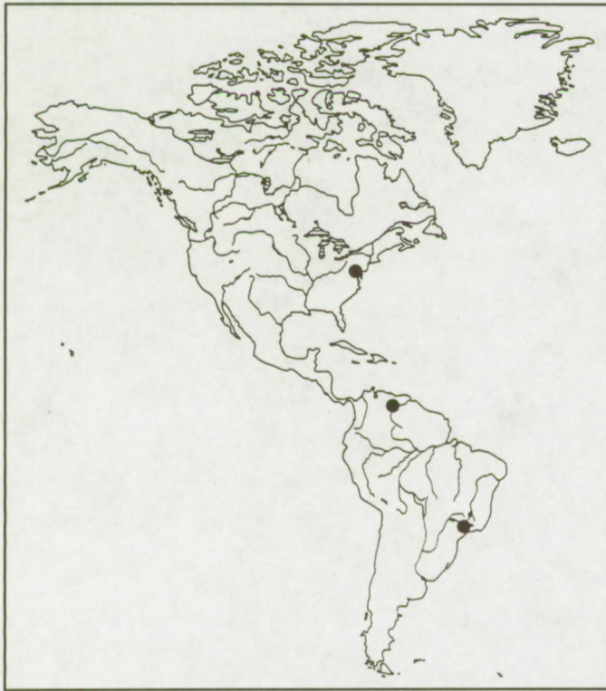
Map 43. L. mitis Haring & Myers