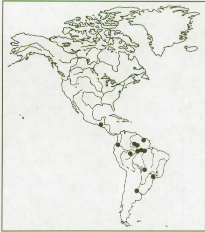
Map 21. L. eutarsa Harring & Myers