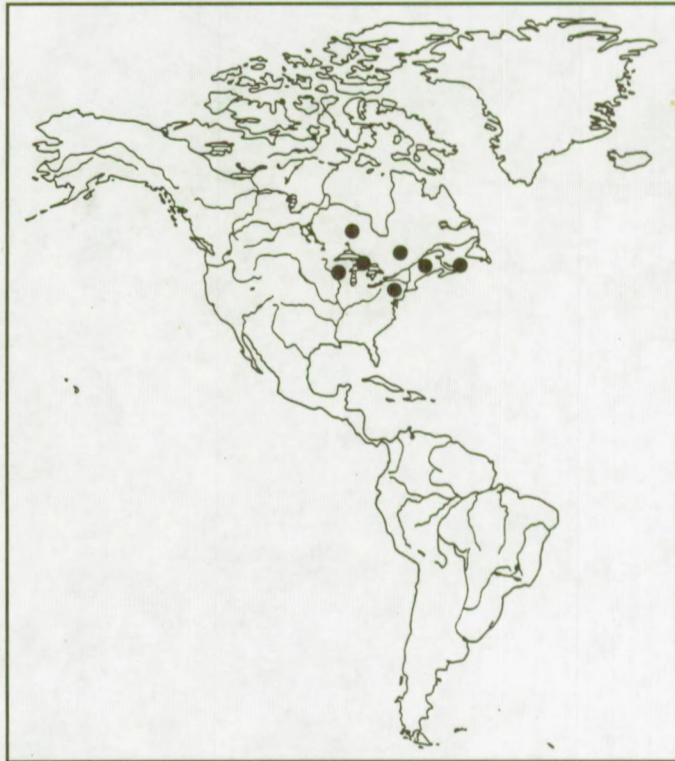
Map 46. L. mucronata Haring & Myers