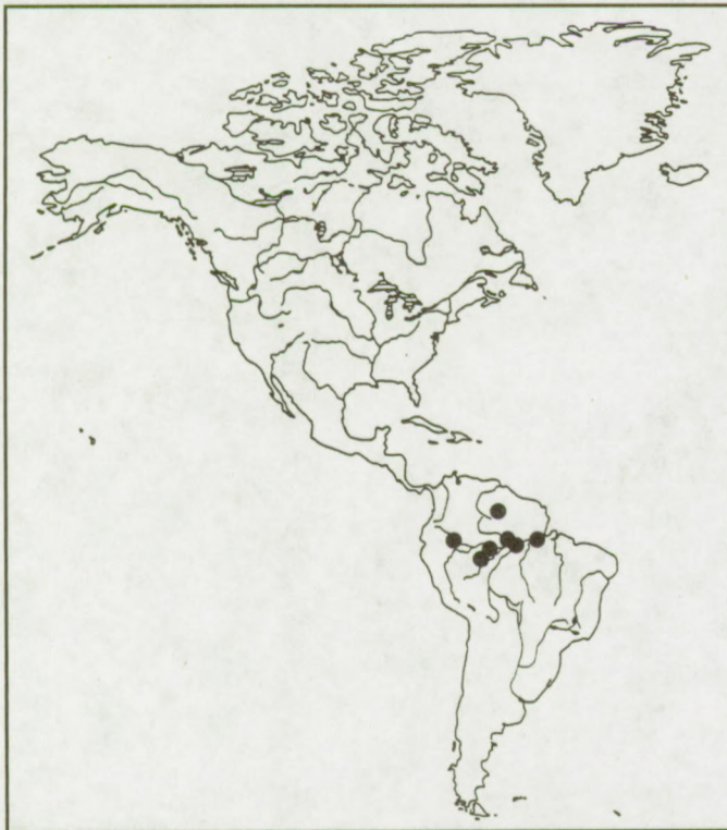
Map 4. L. amazonica (Murray)