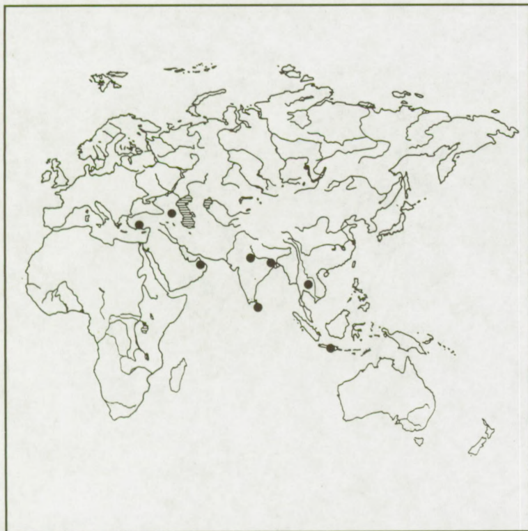
Map 8. L. bifastigata Hauer