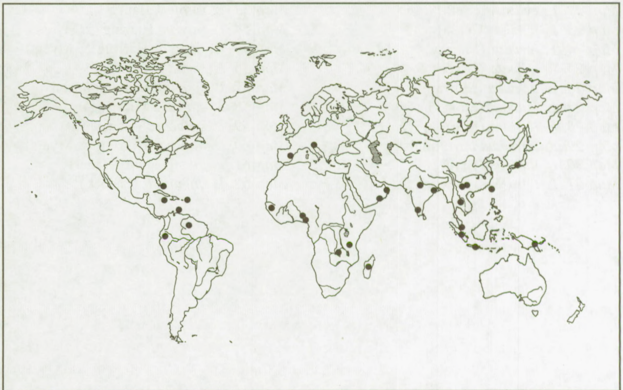
Map 2. L. aculeata (Jakubski)