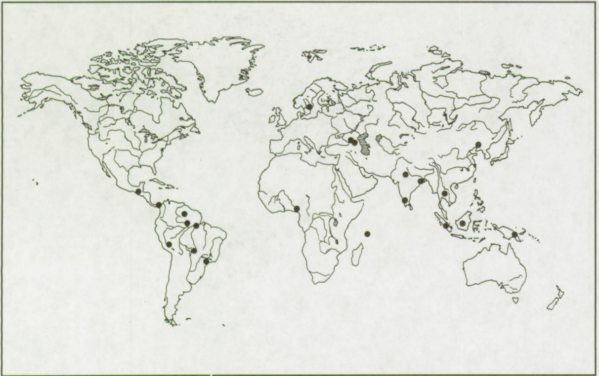
Map 19. L. doryssa Haring