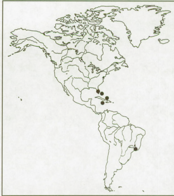
Map 57. L. spinulifera Edmondson