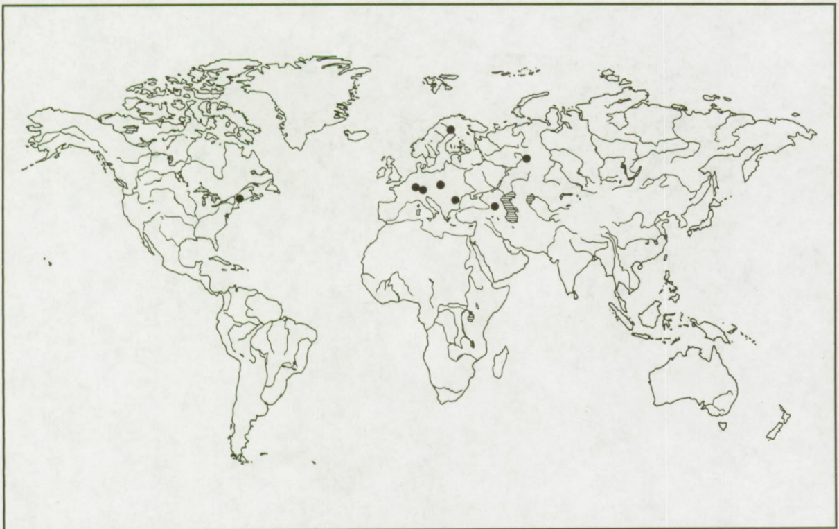
Map 36. lauterborni Hauer