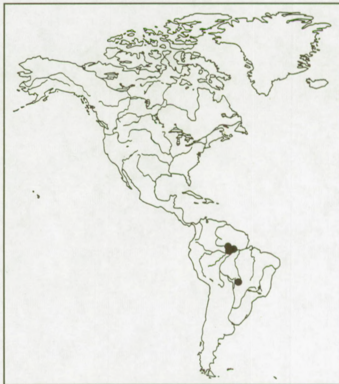
Map 42. L. melini Thomasson