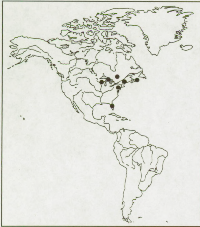
Map 51. L. pyrha Harring & Myers