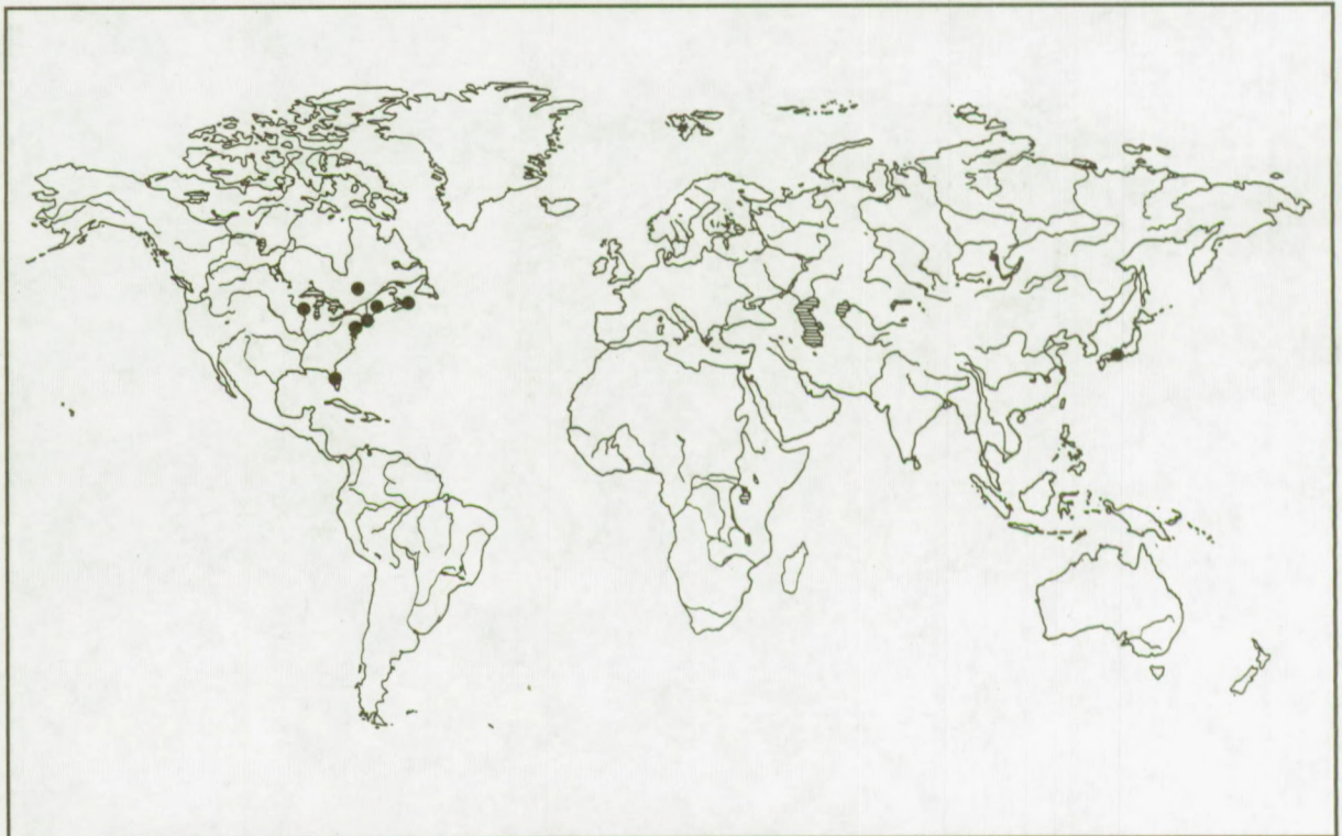
Map 54. L. satyrus Haring & Myers