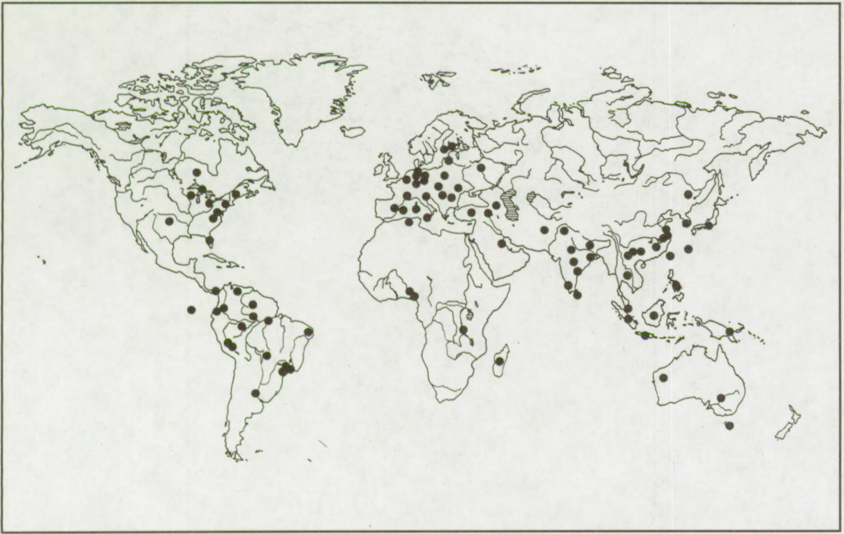
Map 39. L. ludwigii (Eckstein)