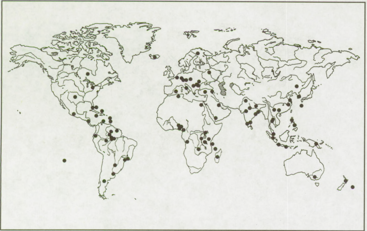
Map 27. L. hamata (Stokes)