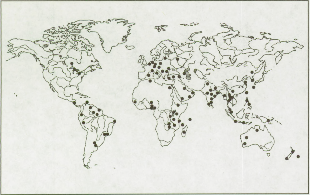
Map 11. L. bulla (Gosse)