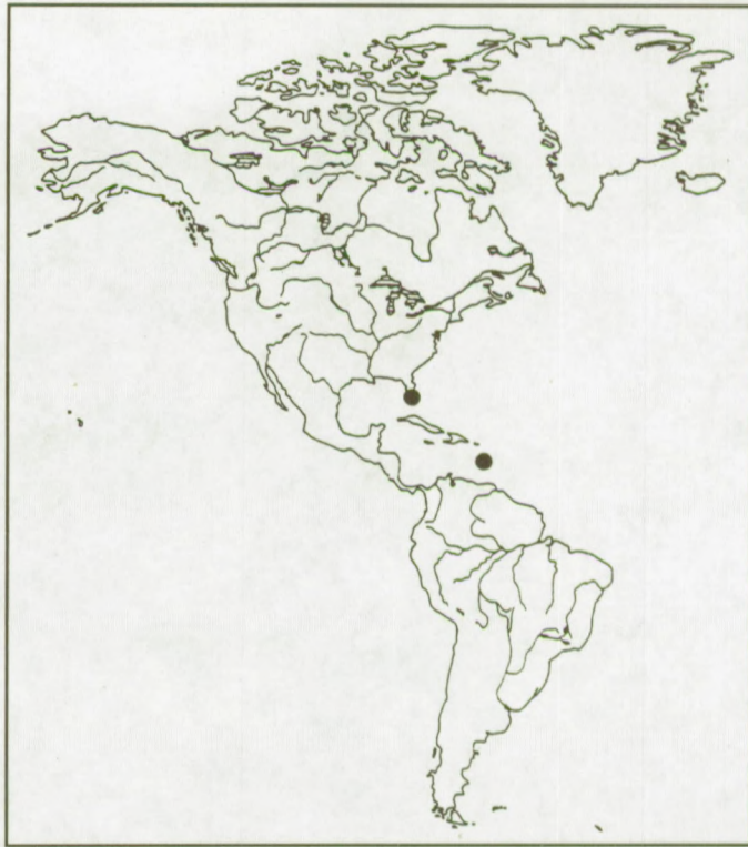
Map 41. L. margarethae Segers