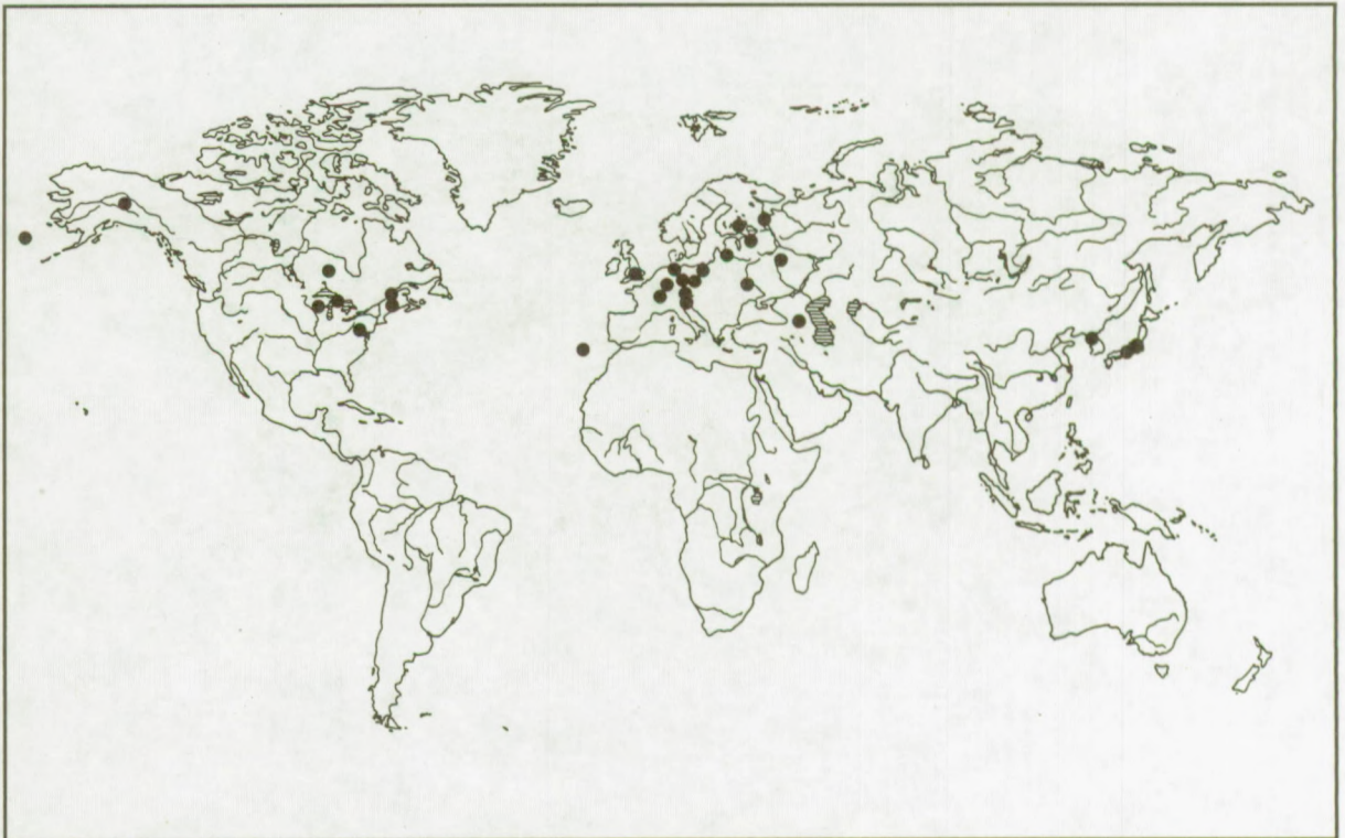
Map 18. L. depressa (Bryce)