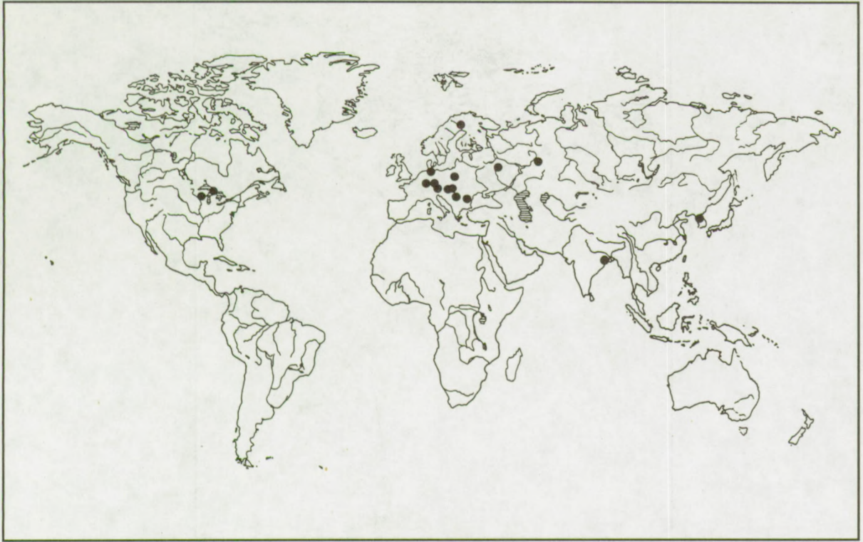
Map 55. L. scutata (Harring & Myers)