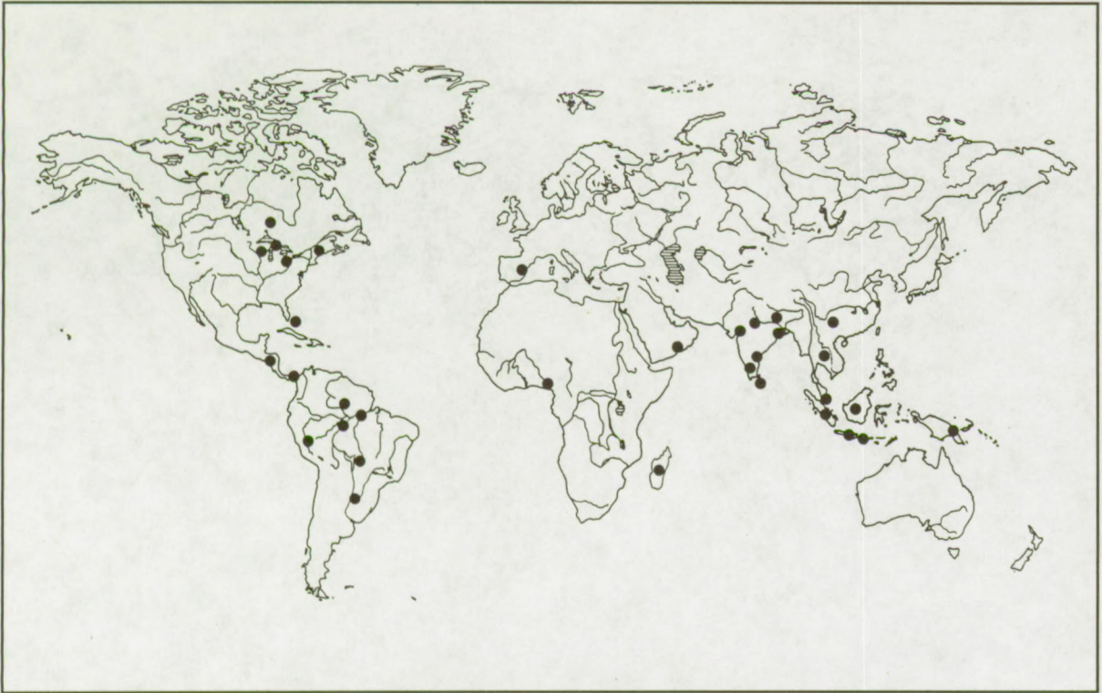
Map 15. L. crepida Harring