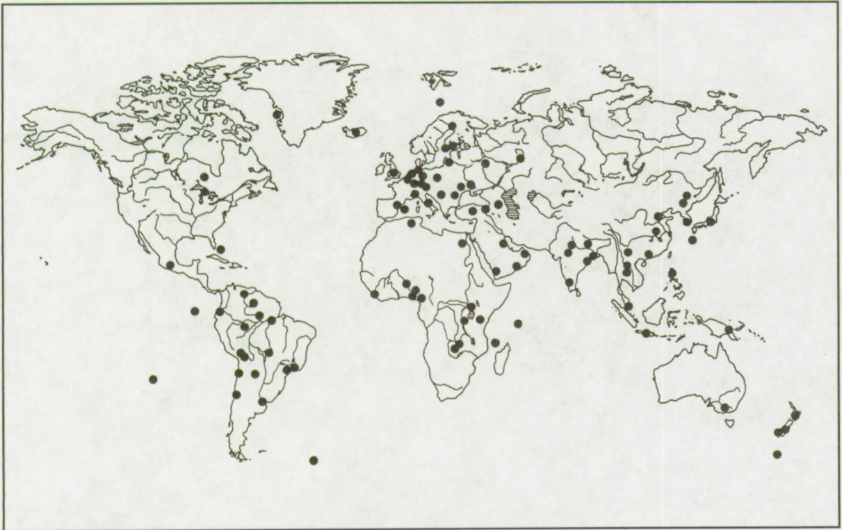
Map 12. L. closterocerca (Schmarda)