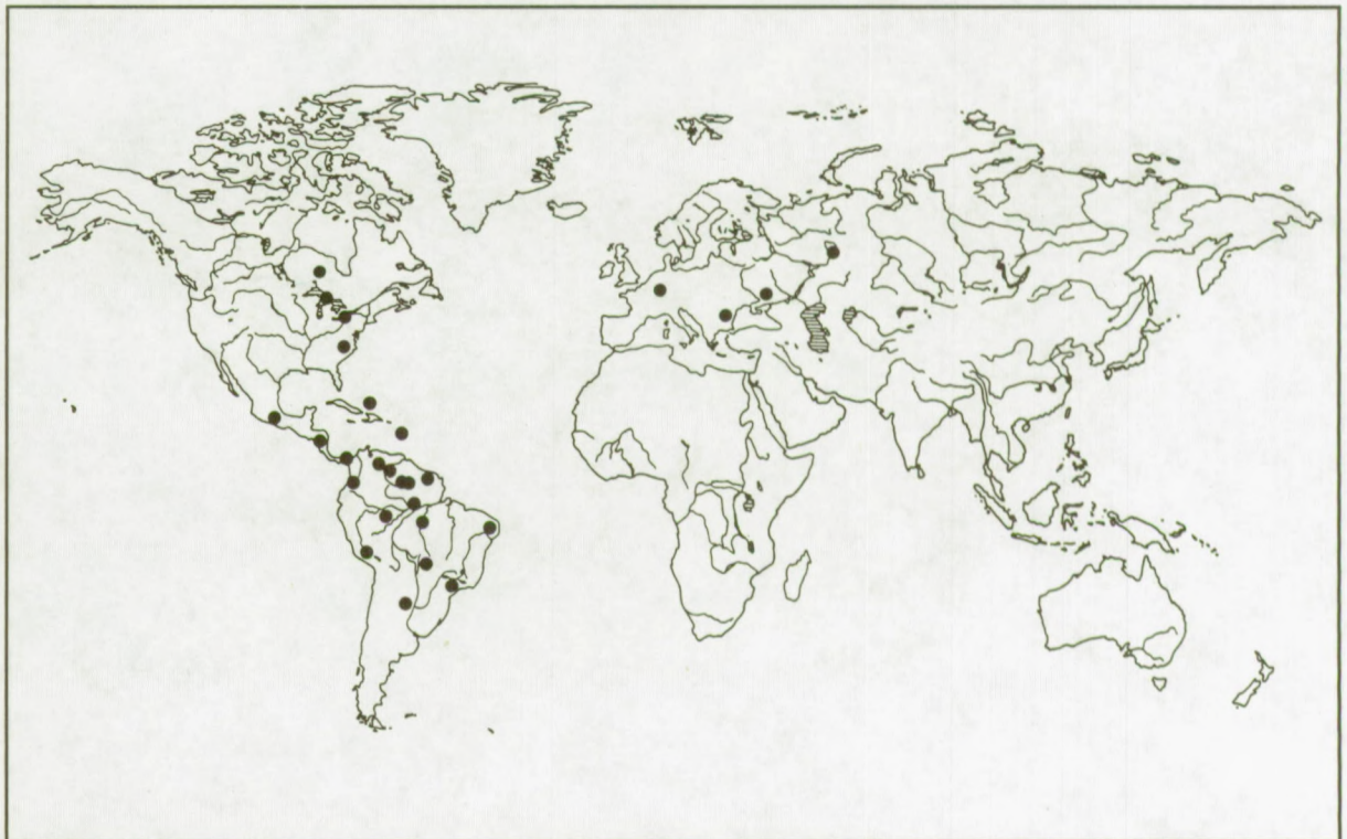
Map 14. L. cornuta (Müller)