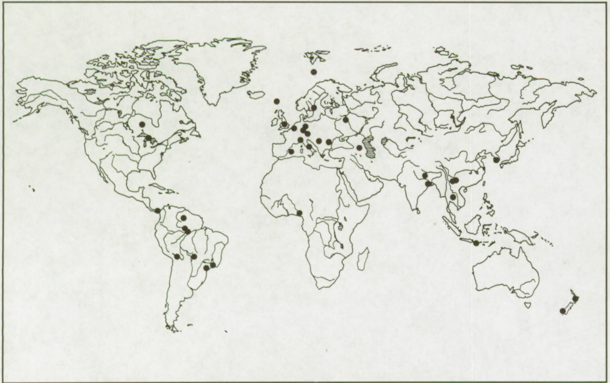
Map 23. L. flexilis (Gosse)