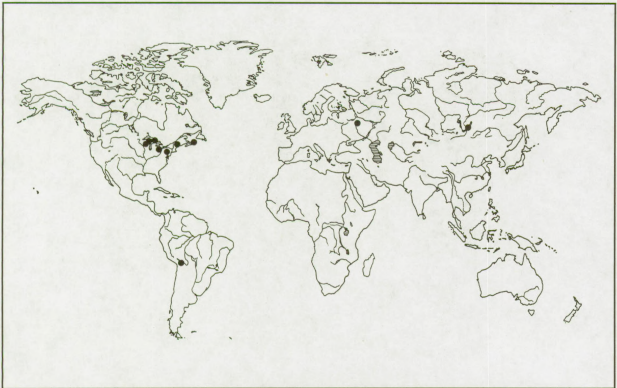
Map 52. L. rhopalura (Harring & Myers)