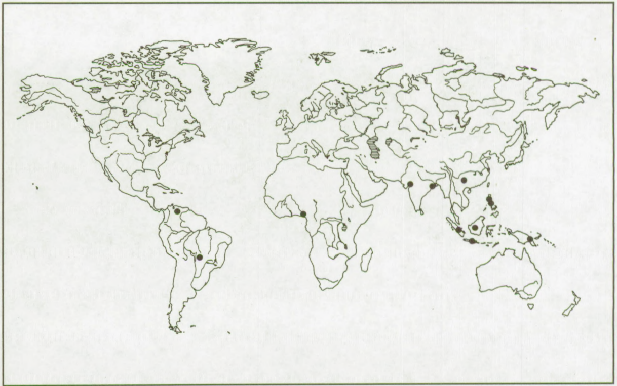
Map 61. L. thienemanni (Hauer)