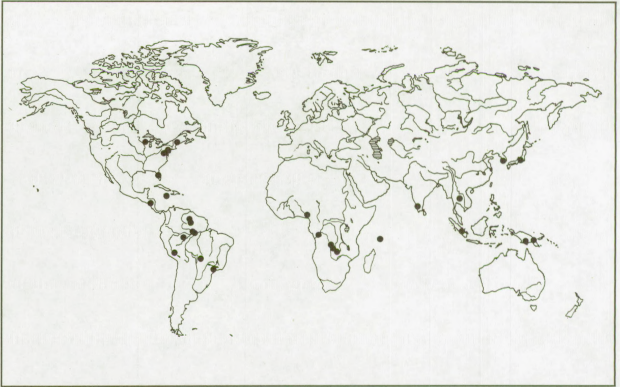
Map 45. L. monostyla (Daday)