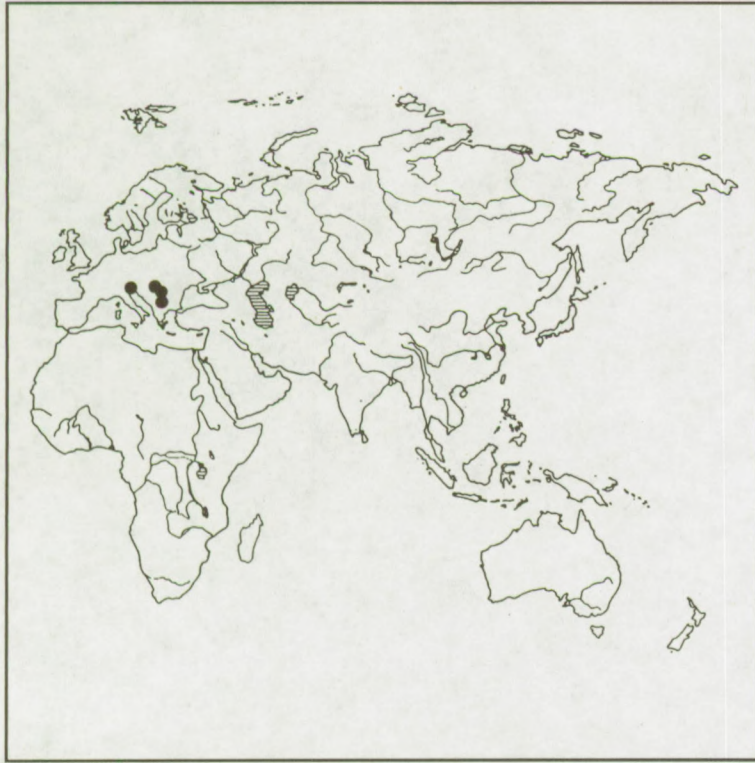
Map 31. L. ivli (Wiszniewski)