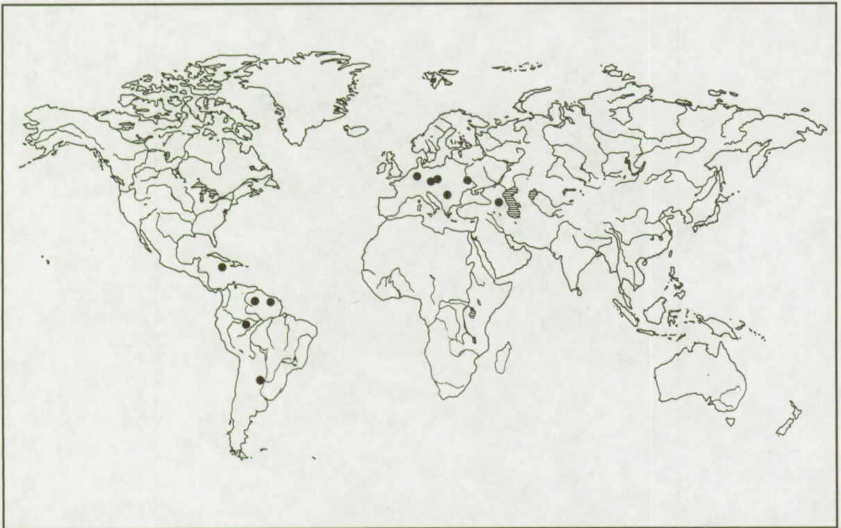
Map 20. L. elsa Hauer