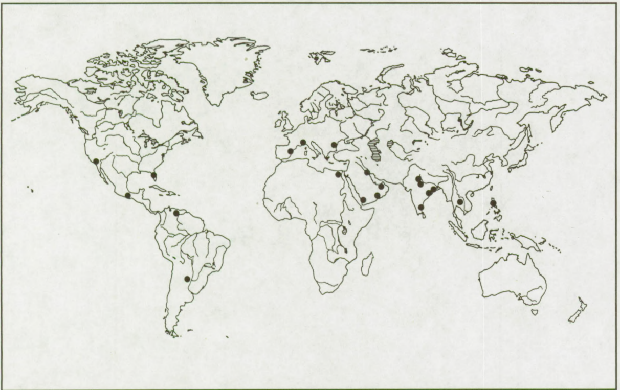
Map 60. L. thalera (Harring & Myers)