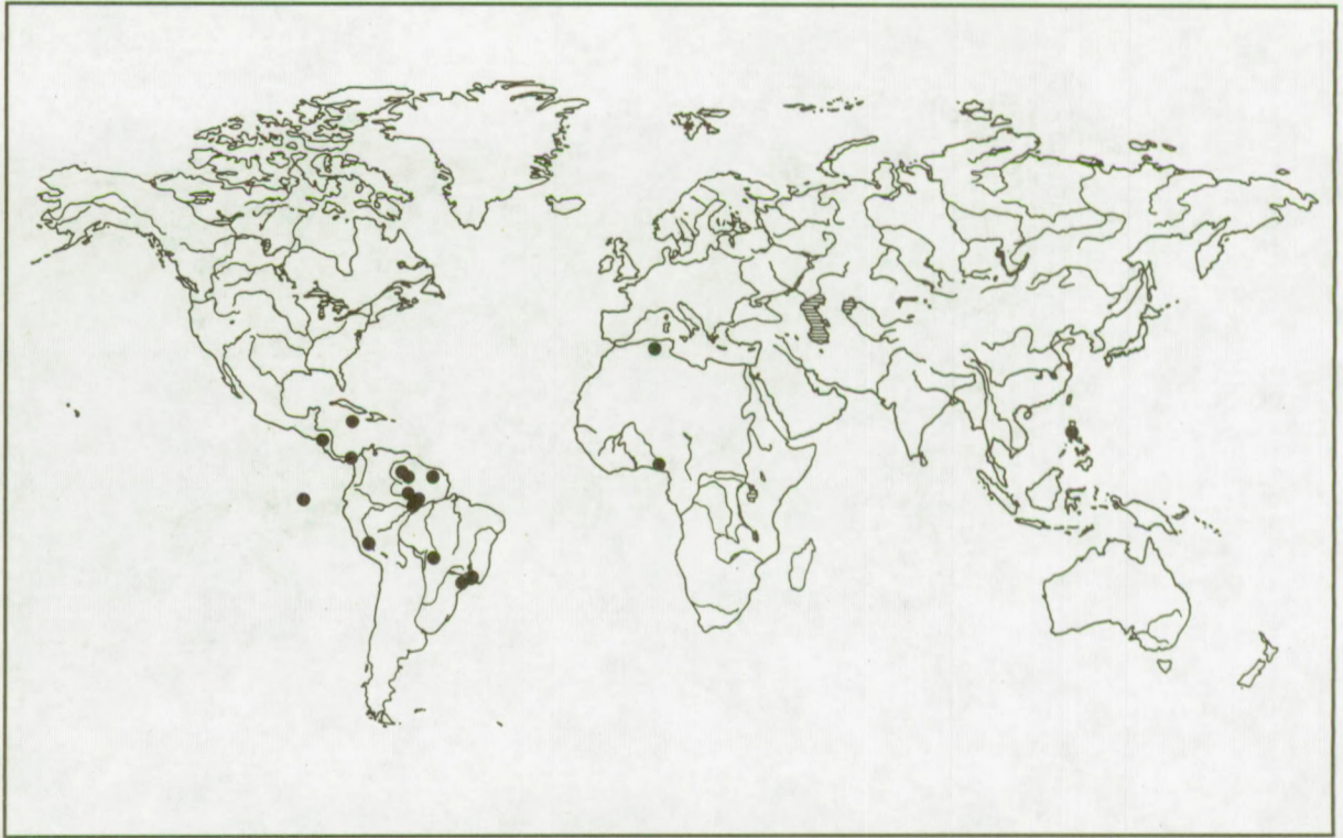
Map 17. L. decipiens (Murray)