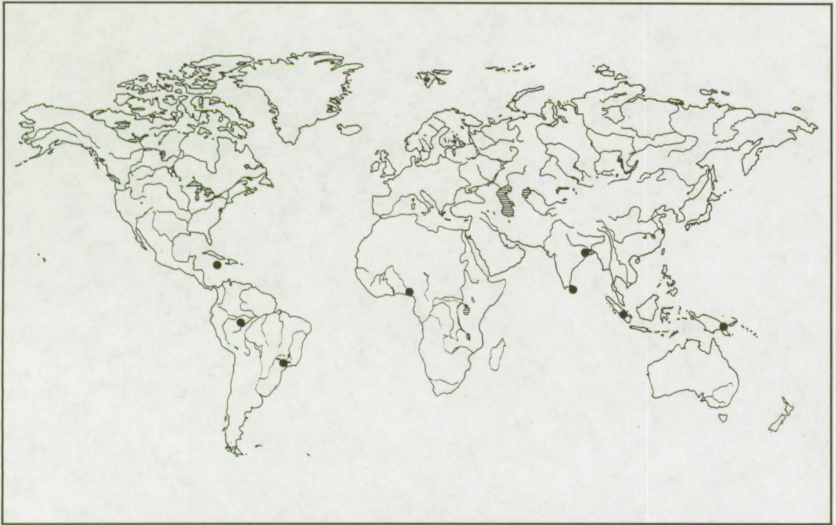
Map 59. L. syngenes (Hauer)