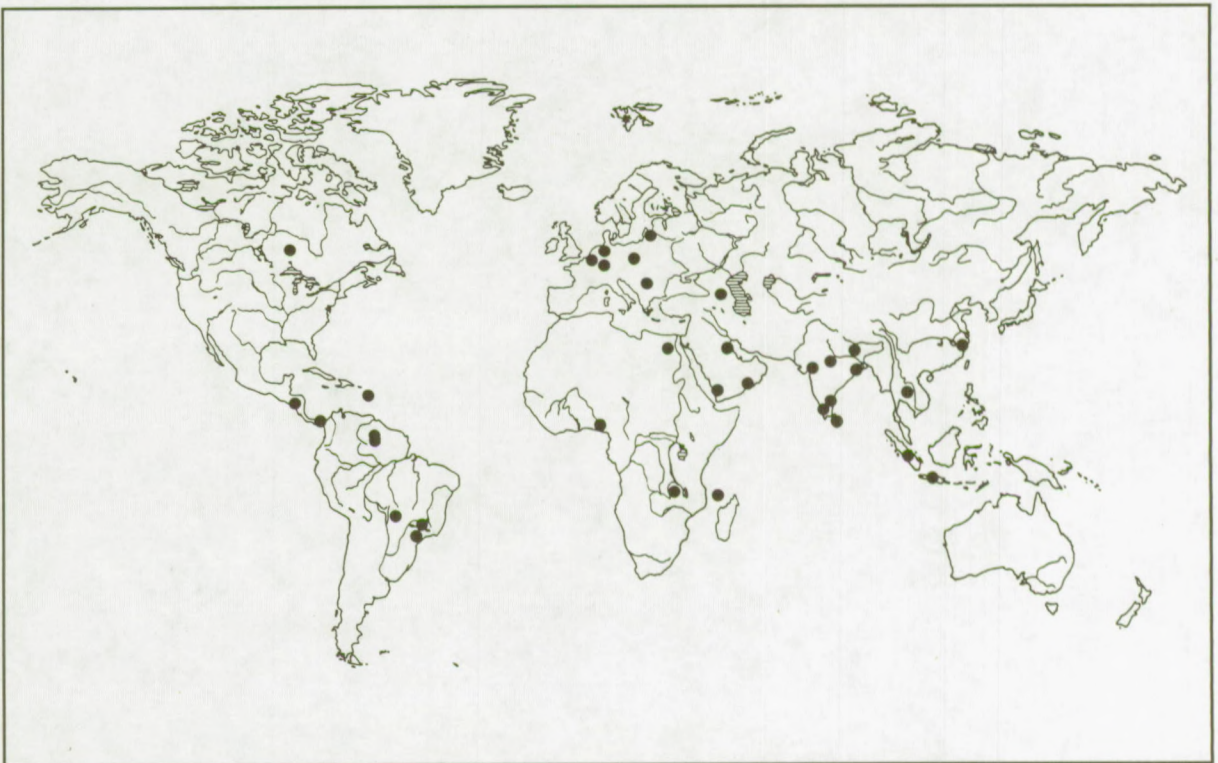
Map 6. L. arcula Harring