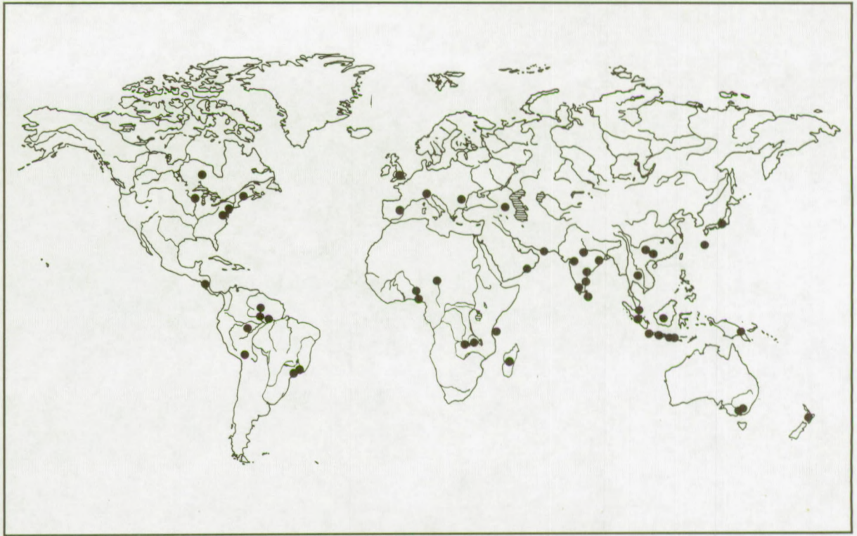
Map 29. L. hornemanni Ehrenberg