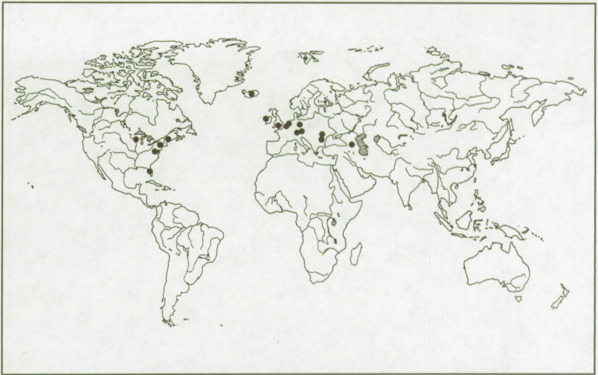
Map 25. L. galeata (Bryce)