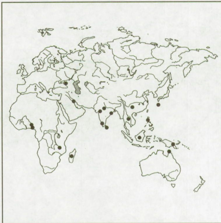
Map 62. L. unguitata (Fadeev)