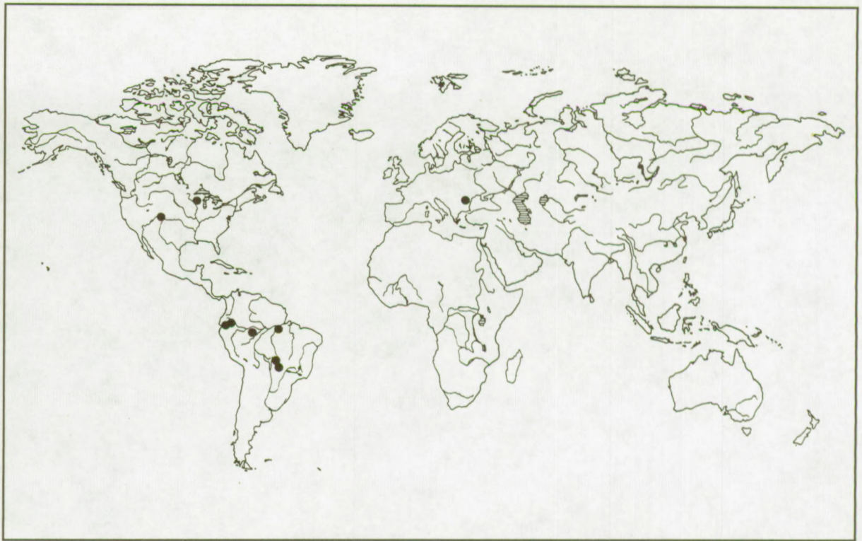
Map 13. L. copeis (Harring & Myers)