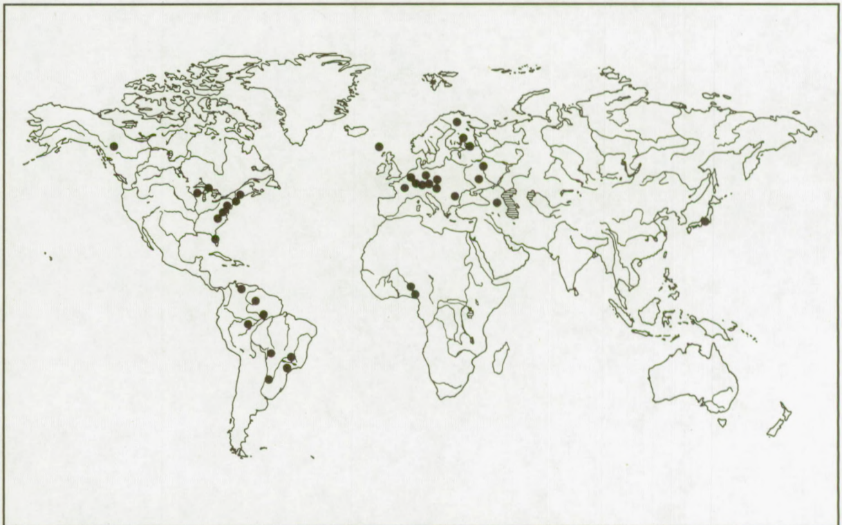
Map 58. L. stichaea (Harring)