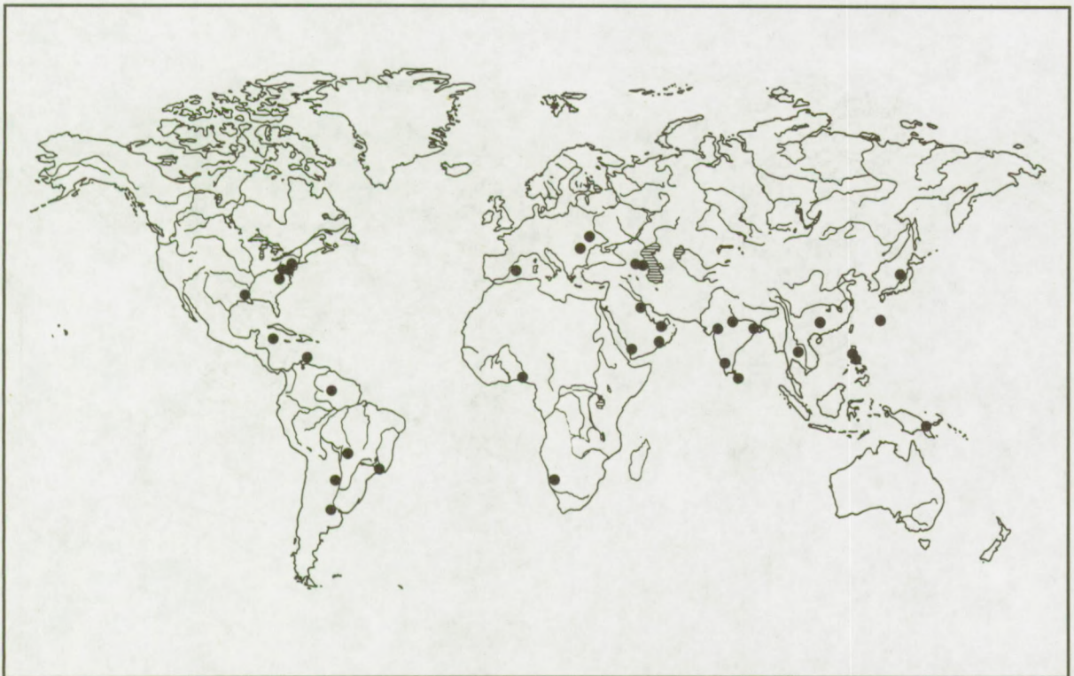
Map 28. L. hastata (Murray)