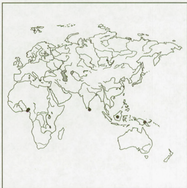
Map 10. L. braumi Koste