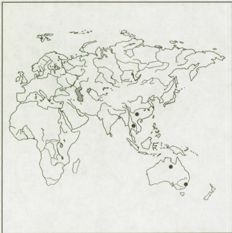
Map 7. L. batillifer (Murray)