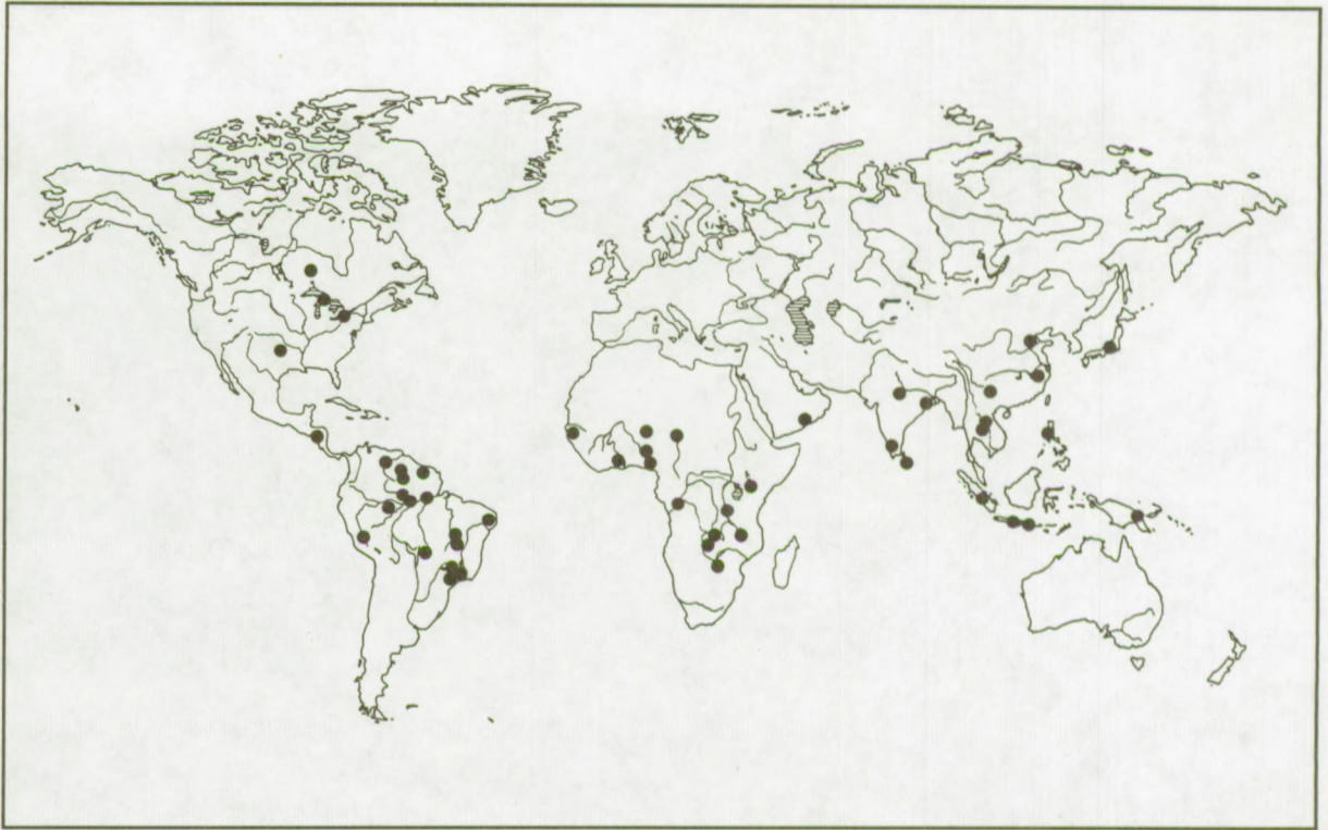
Map 37. L. leontina (Turner)