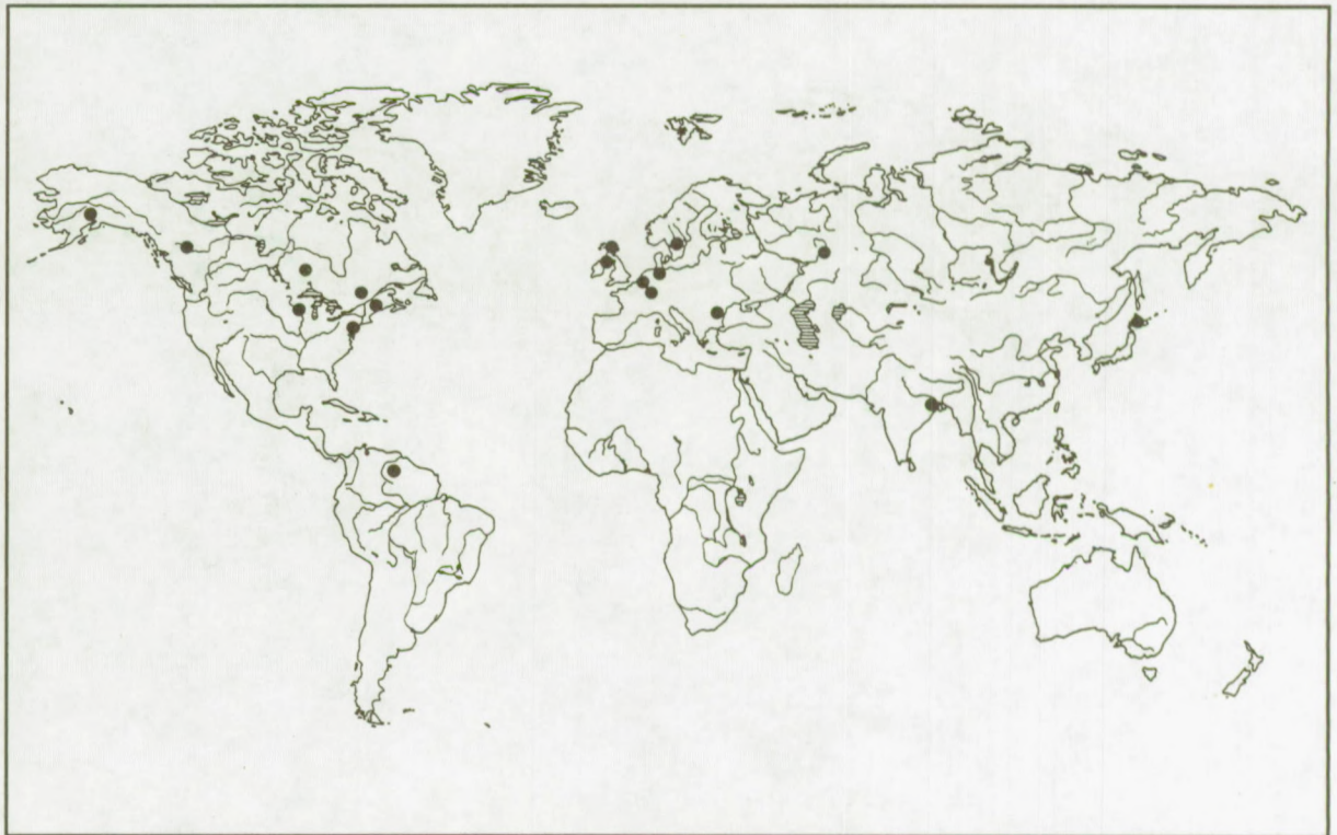
Map 38. L. ligona (Dunlop)