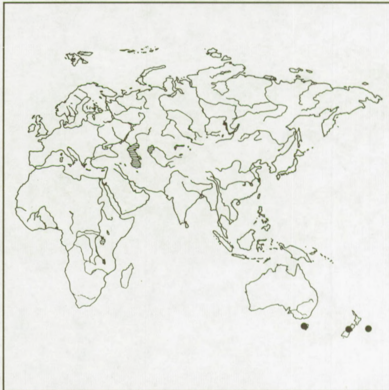
Map 22. L. eylesi Russell