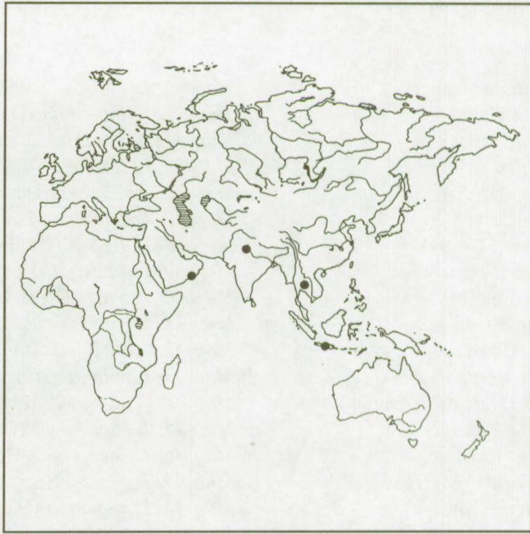
Map 1. L. acanthinula (Hauer)