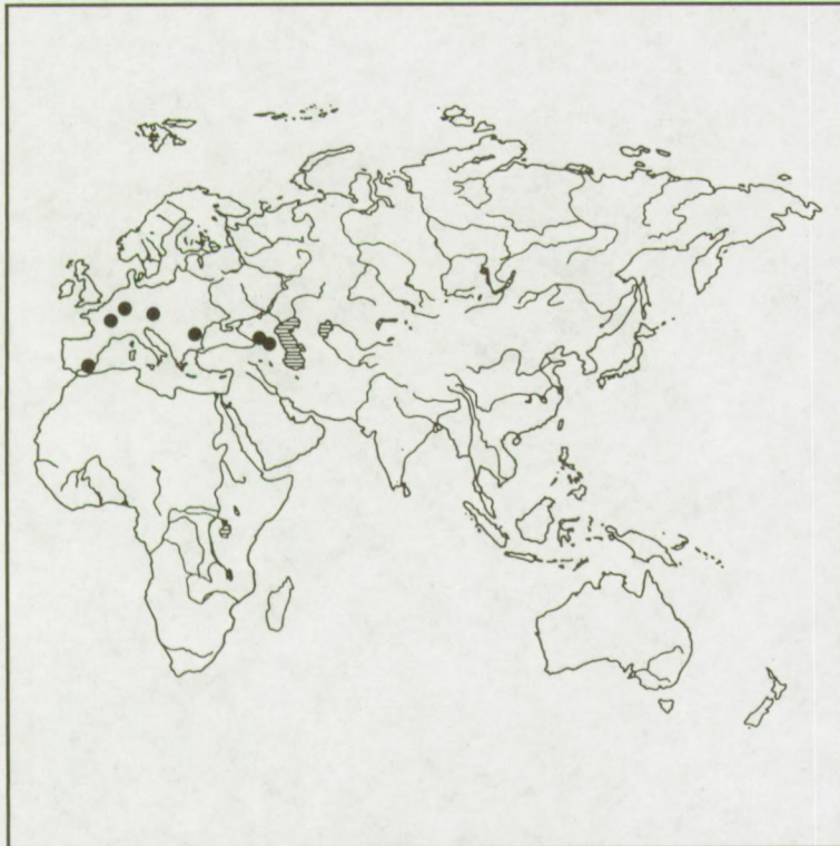
Map 32. L. kluchor Tarnogradski