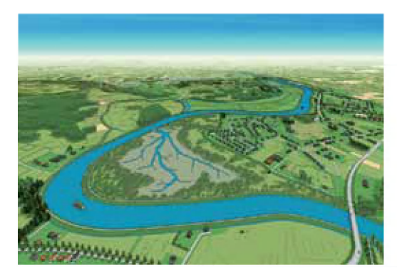
Figure 0.2. Bergenmeersen at low tide