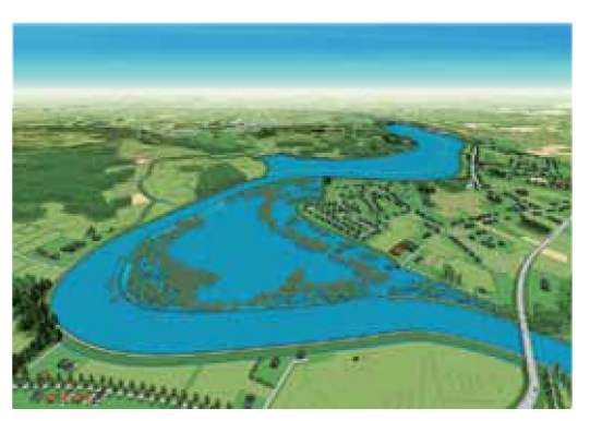
Figure 0.5. Bergenmeersen at storm tide