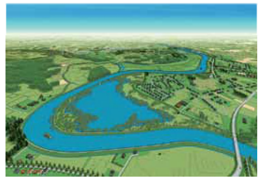
Figure 0.4. Bergenmeersen at spring tide