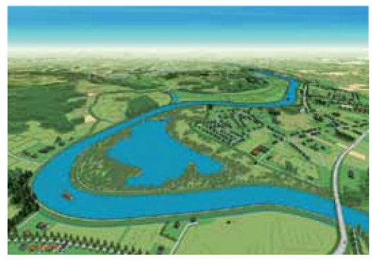
Figure 0.3. Bergenmeersen at high tide