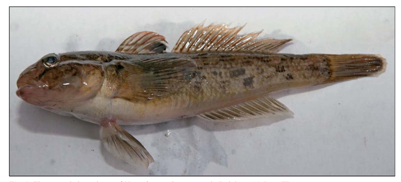
Fig. 2. First recorded specimen of Neogobius melanostomus in Belgium (10.5 cm TL)