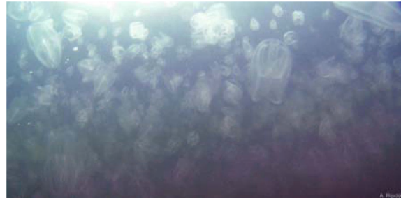
Figure 3: Underwater photo of a Mnemiopsis leidyi bloom near Bommenede in the Grevelingen (26.08.2006).

Between August and November 2006, lobate ctenophores were seen in the two different estuarine regions along the Dutch coast, in the Wadden Sea in the north and the southwestern estuaries (the Grevelingen, Oosterschelde and Westerschelde) (Figure 1; Annex), oftentimes in extremely large aggregations (Figure 3).