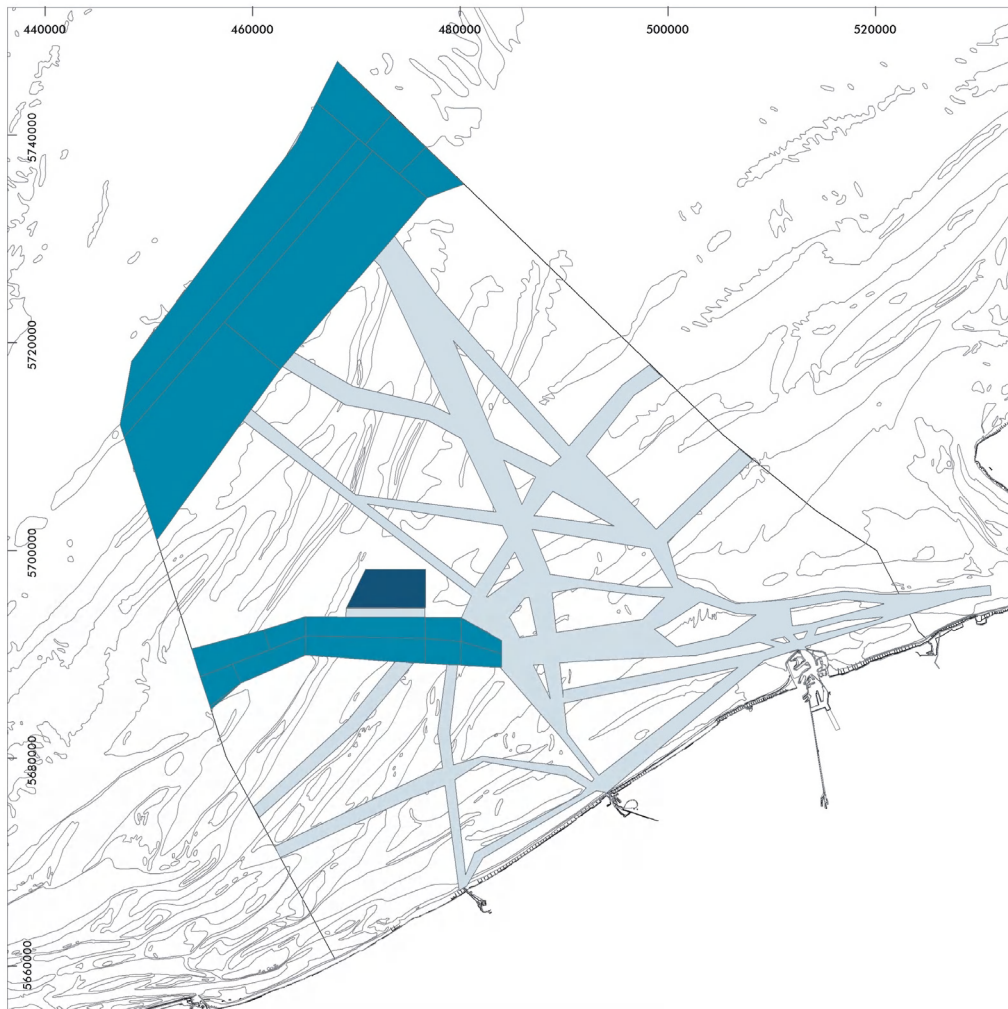
Map I.3.3a. Shipping and anchorage: spatial distribution