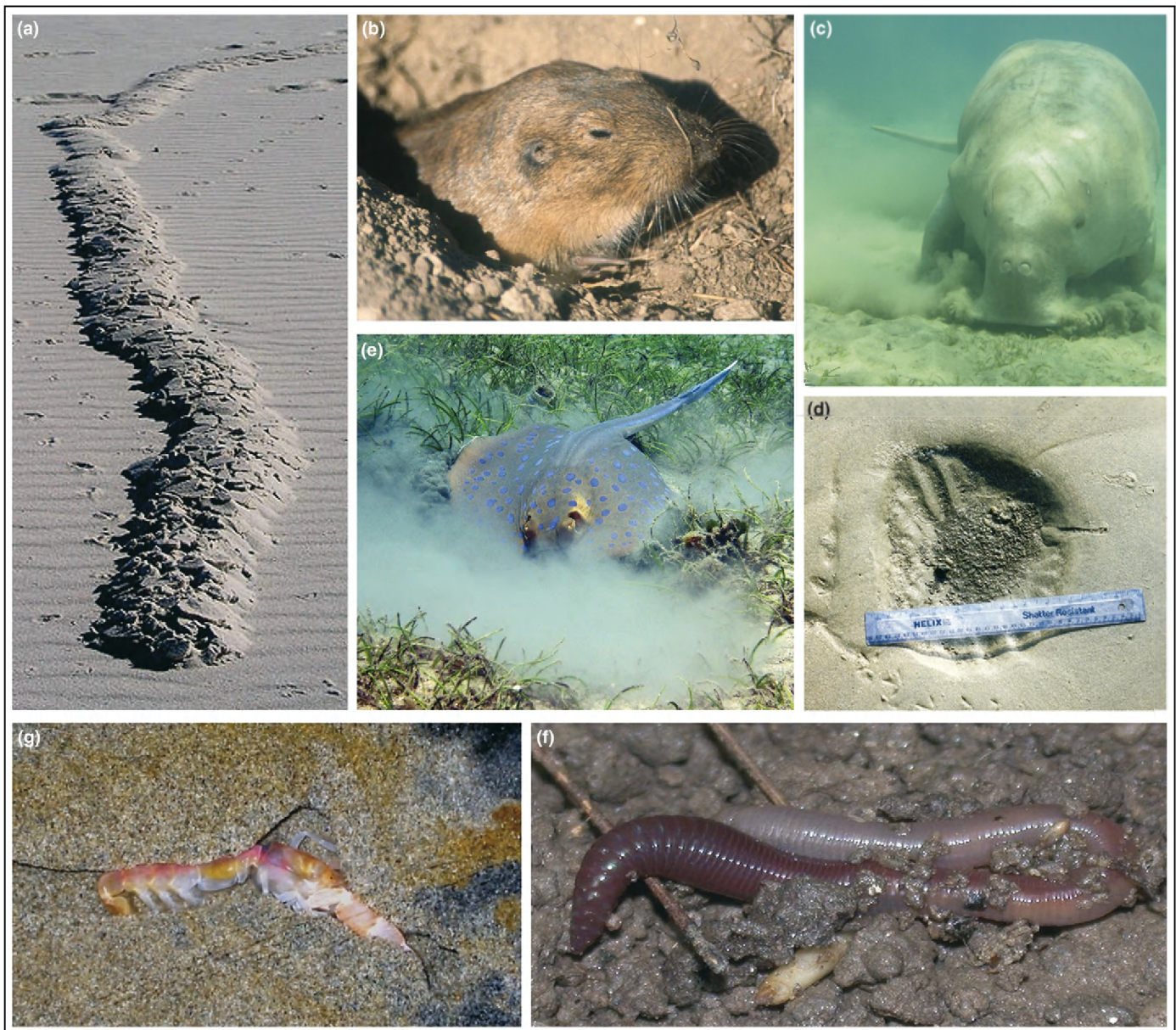
Figure 1. Bioturbation results from a range of animal activities. The most eye-catching are those created by larger subterranean mammals [13], such as insectivorous moles [(a) mole track at Noordhoek beach, Cape Town] and herbivorous pocket gophers Thomomys talpoides macrotis (b) in prairie grasslands. In the marine environment, large-scale burrowing is also present, but less easily detectable [7]. Side-scan sonar has revealed conspicuous trenches (4-m long, by 2-m wide, by 0.4-m deep) created by grey whales in search of benthic amphipods, and long linear traces (0.4-m deep by 50-m long) generated by walrus ploughing the surface sediment in search for bivalves. In seagrass meadows, similar-sized pits and trails are created by herbivores, such as geese and dugong Dugong dugong (c) feeding on rhizomes. On tidal flats, smaller feeding pits (d) (up to 1-m wide and 30-cm deep) are attributed to stingrays such as the blue-spotted stingray Taeniura lymma (e). Small invertebrates have a small per capita impact, but are dominant from a global perspective because of their sheer abundance and ubiquity [7]; examples include ants, termites and the common earthworm Lumbricus terrestris (f). In the marine environment, the predominant bioturbators are deposit-feeding polychaetes and various burrowing crustaceans, such as burrowing shrimp [(g) geochemical gradients created in a laboratory observatory by the shrimp Neotrypaea californiensis ].

ocean floor via pellet production, track formation and different types of construction, such as mounds and pits [17]. This biologically induced roughness modifies the hydrodynamics above the sediment layer, which in turn affects erosion and resuspension [8]. In addition, active sediment transport could also operate, as suspension feeders capture food particles from the water column (biodeposition) or deposit feeders eject fluidised faecal pellets into the water column (bioresuspension) [18]. Even in coastal systems, which are traditionally seen as shaped only by the physical forces of currents and waves, hydraulic engineers have recently recognised