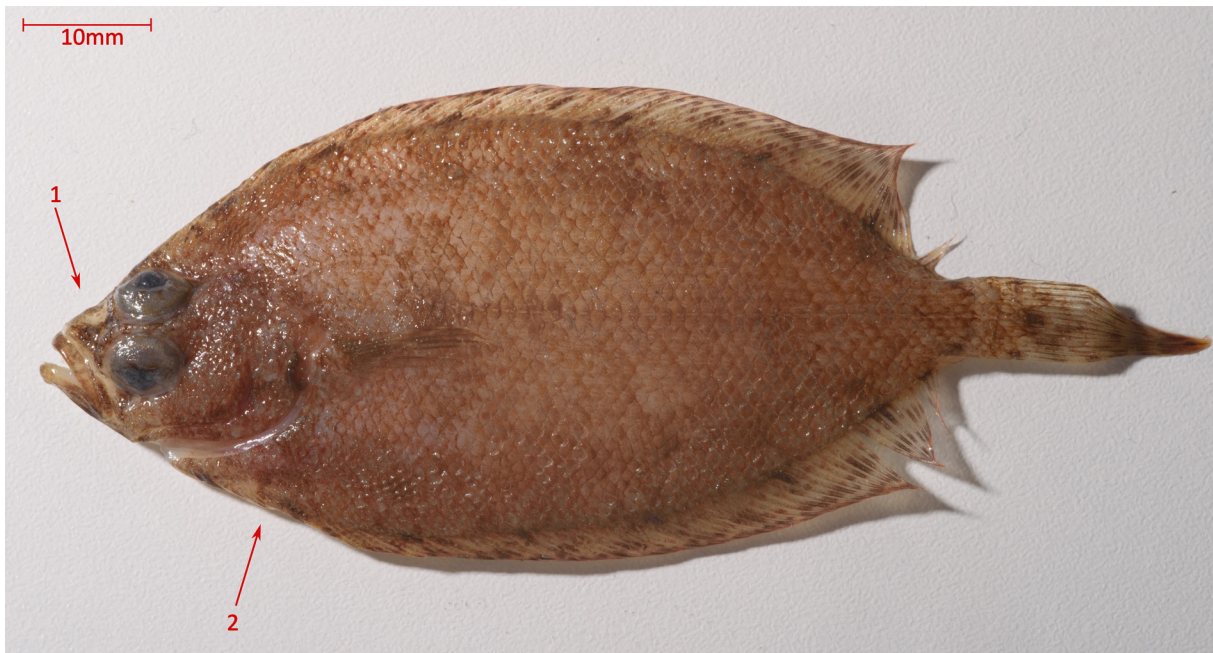
Figure 4 – Zeugopterus norvegicus caught off the UK coast, preserved by freezing (total length 91 mm), August 2022. Pointed head lacking a distinct notch (1), and separated pelvic and anal fins (2) are shown.

Ship time for ILVO fish trails on board of R.V. Belgica was provided by BELSPO through RBINS and funded by the European Maritime and Fisheries Fund (EFMZV). Special thanks to the crew of the