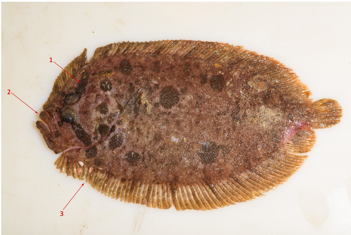
Figure 3 – Zeugopterus punctatus, size not registered, caught in the English Channel, United Kingdom, 2023-03-06. Numbers indicate the dark band (1), the large mouth (2), and fused pelvic and anal fins (3).

There are multiple hypotheses why there have not been any observations of topknots in the BPNS before. All three species are associated with rough substrates that are difficult to trawl. Consequently, this makes them harder to detect during trawling surveys. These types of hard substrates are naturally absent in the BPNS, with the exception of some areas with gravel beds and artificial structures. Yet, the location where the Belgian specimen of Z. regius was caught, is not known to have natural rocky