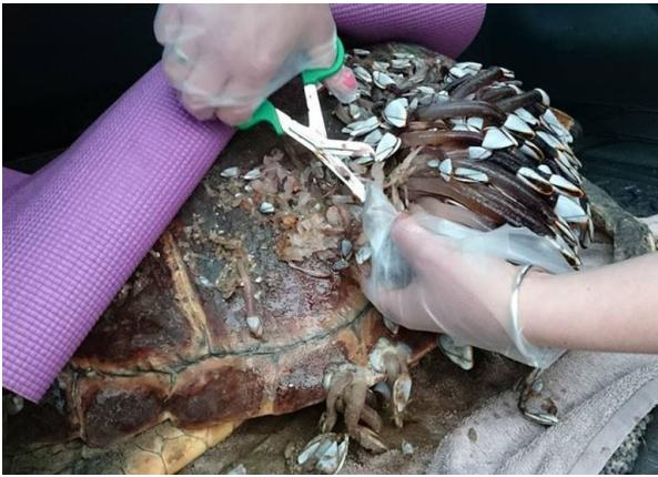
Fig. 3. Removal of goose barnacles ( Lepas anatifera ) from loggerhead turtle ( Caretta caretta ) from Irvine Beach, Scotland, December 2015.