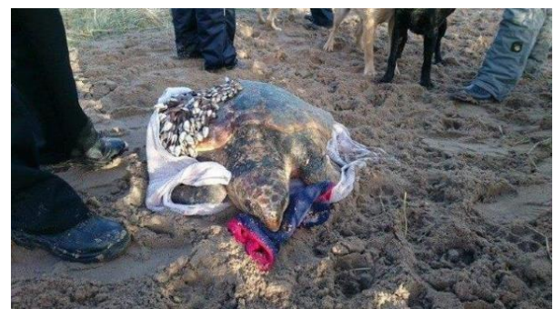
Fig. 1. Loggerhead turtle ( Caretta caretta ) (frontal view) stranded on Irvine Beach, Scotland, December 2015.

On 5th December 2015, in the wake of Storm Desmond, a loggerhead turtle was washed ashore on Irvine beach in the Firth of Clyde, Scotland (M408/15 in SMASS database, National Reference number T2015/02). The turtle was found alive, but moribund, by participants from a nearby cycling event, and the British Divers Marine Life Rescue and Scottish SPCA were alerted. The turtle, a young female, 72 cm in length and weighing 28 kg, had a malformed right front flipper and was heavily infested by goose barnacles on the upper right side (Fig. 1). The turtle was transferred to the Scottish Sea Life Sanctuary at Oban for rehabilitation. The goose barnacles were removed but unfortunately the turtle died a few days later (Scottish Sea Life Sanctuary, 2015). The turtle was subsequently necropsied by SMASS and the cause of death was considered most likely to have been cold shock (Brownlow et al. , 2016).