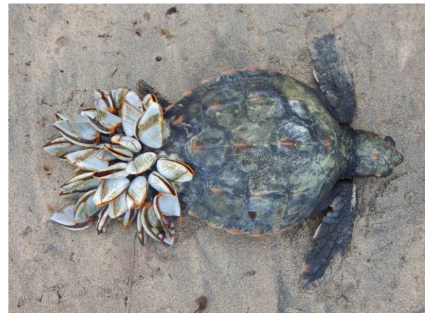
Fig. 8. Loggerhead turtle ( Dermochelys coriacea ) with goose barnacles ( Lepas hillii ), Gwithian Beach, Cornwall, England, January 2016.

The second, in January 2016, a juvenile loggerhead was found stranded alive, by David Fenwick, at Gwithian beach, Hayle, Cornwall, England (Ref. No. T2006/39; BBC 2016a,b; Penrose & Gander, 2017). There were around 30 goose barnacles attached to the rear of the carapace (Fig. 8) which were identified as Lepas hillii .