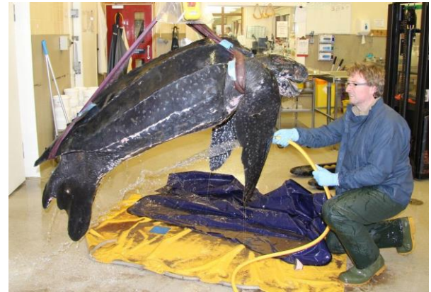
Fig. 5. Leatherback turtle ( Dermochelys coriacea ) from St. Cyrus, Scotland, being weighed prior to necropsy.

Barely a month later, on 8th January 2016, a leatherback turtle was found washed up dead on the beach at St. Cyrus Nature Reserve, Aberdeenshire (Anon., 2016, M24/16 in SMASS database, National Reference number T2016/01). The turtle was an immature male with overall length of 179 cm. It was removed from the beach and brought to the SMASS laboratory for examination (Fig. 5). The turtle weighed 209 kg and the subsequent necropsy suggested the cause of death was probably hypothermia (Brownlow et al. 2017; Penrose & Gander, 2017). It seems likely that the turtle may have been a victim of the then recent Storm Frank.