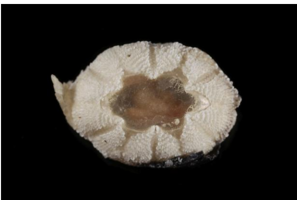
Fig. 11. Acorn Barnacle ( Stomatolepas dermochelys ) from leatherback turtle ( Dermochelys coriacea ), Marazion, Cornwall, England, August 2018 (underside view showing protrusions used to embed the barnacle into the turtle).

floating objects. In British waters they are well known from ship hulls and flotsam (MBA, 1957; Evans, 2000) and are frequently cast ashore, especially on the western and south-western coasts of Britain and Ireland (Trehwella & Hatcher, 2015). They can be transported considerable distances by oceanic currents such as the