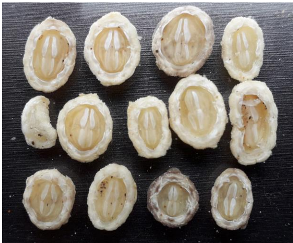
Fig. 7. Acorn Barnacles ( Stomatolepas dermochelys ) from St. Cyrus leatherback turtle (opercular view; longest barnacle to the right is 11 mm in length).

The first, in December 2006, a live loggerhead (length 84 cm, weight 36.5 kg) was found on Cefn Sidan Sands, Pembrey Country Park, Carmarthenshire, Wales, during strong south-westerly storms (Ref. No. T2006/39; Penrose & Gander, 2007). Most of the front left flipper was missing but this had healed indicating it was an old injury. Around six Lepas anatifera goose