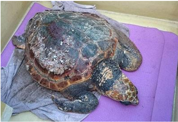
Fig. 4. Loggerhead turtle ( Caretta caretta ) from Irvine Beach, Scotland, after removal of goose barnacles ( Lepas anatifera ). December 2015.

radial ridges), the narrow gap between the carina and scutum plates, and the absence of any rust-coloured band at the top of the peduncle (Broch, 1959; Southward, 2008). It can be estimated from the photographs and the turtle image with a scale shown in Brownlow et al. (2016) that the largest barnacles were around 10 cm long, and it appears that around 80 to 100 were attached to the turtle. It is probable that the deformed flipper restricted the turtle's swimming