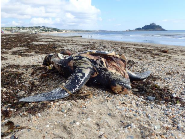
Fig. 9. Leatherback turtle ( Dermochelys coriacea ) at Marazion, Cornwall, England, August 2018. The underside has been opened for necropsy.