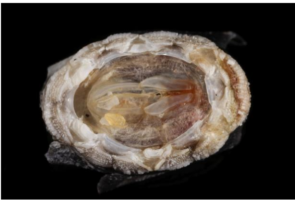
Fig. 10. Acorn Barnacle ( Stomatolepas dermochelys ) from leatherback turtle ( Dermochelys coriacea ), Marazion, Cornwall, England, August 2018 (opercular view from which the feeding cirri protrude).