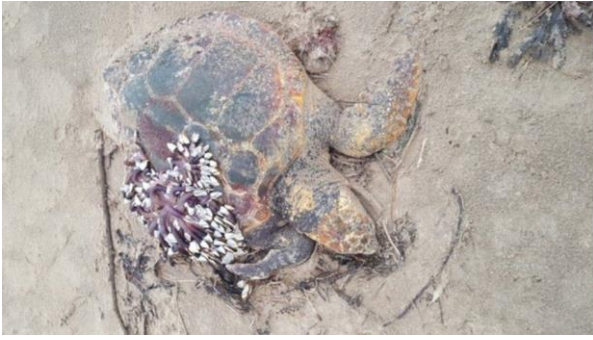
Fig. 2. Loggerhead turtle ( Caretta caretta ) (dorsal view) stranded on Irvine Beach, Scotland, December 2015.