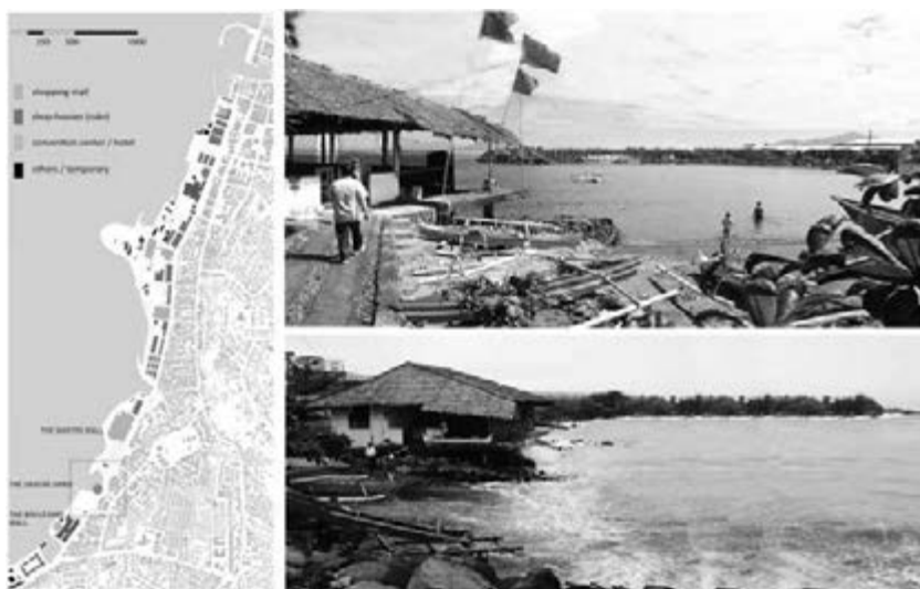
Figure 11.3 Location of the Daseng Sario between the Mantos Mall and the Boulevard Mall, and the image of Daseng Sario

Sources: Map image: author; Daseng Sario images: Harsono for Mongabay Indonesia 2013 (above); and Nugraha for Komunitas Pasir 2013 (below)