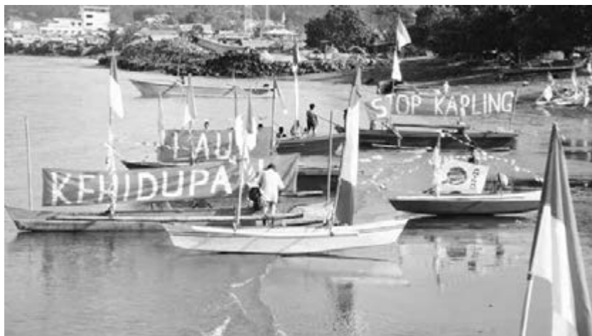
Figure 11.2 The Sario fishermen's protest against the BCP expansion