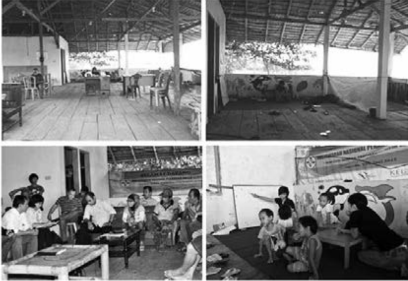
Figure 11.4 The Daseng Sario with and without activities. Upper: the Daseng Sario when there was no activity. Below left: the Daseng -held negotiation among Komnas HAM, Sario fishermen, the local government, and the developer. Below right: daily educational activities for children at the Daseng