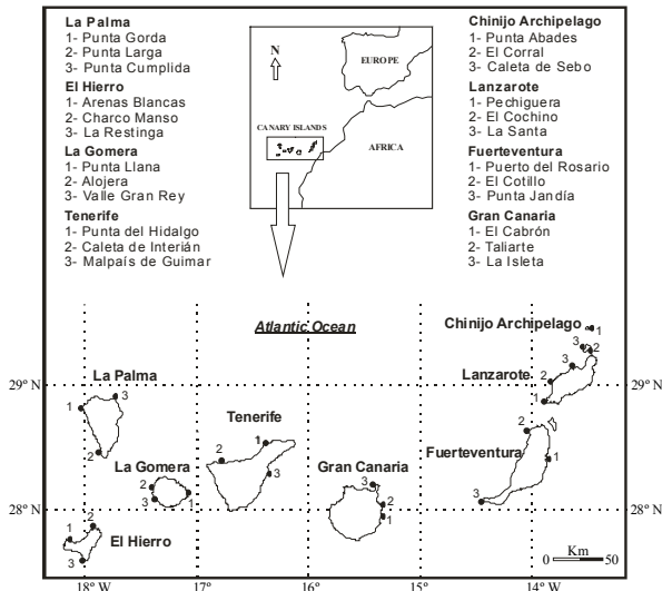
Figure 1: Location of sampling sites where samples of molluscs were recollected along the rocky coasts of the Canary Islands.

Until now, no study has compared the metal levels of different species of molluscs throughout the Canary Archipelago. Díaz et al [9] and Collado [10] studied metal concentrations in limpets or in topsnail but only in one island and without distinguishing between species or studying a unique species of limpet [11]. In our work, we have focused in the metal levels (Cu, Cd, Pb, and Zn) in two species of limpets ( Patella rustica and Patella candei crenata ) along the rocky coasts of the Canary Islands to found out heavy metal contaminations patterns in the different islands and the relations with the biometric parameters.