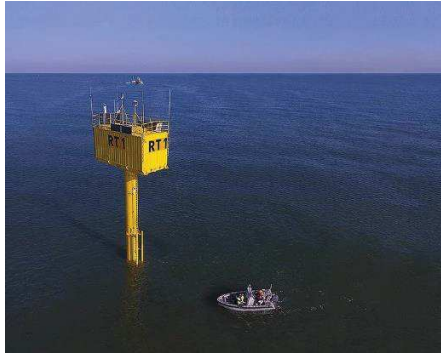
Figure 1. The Blue Accelerator platform.