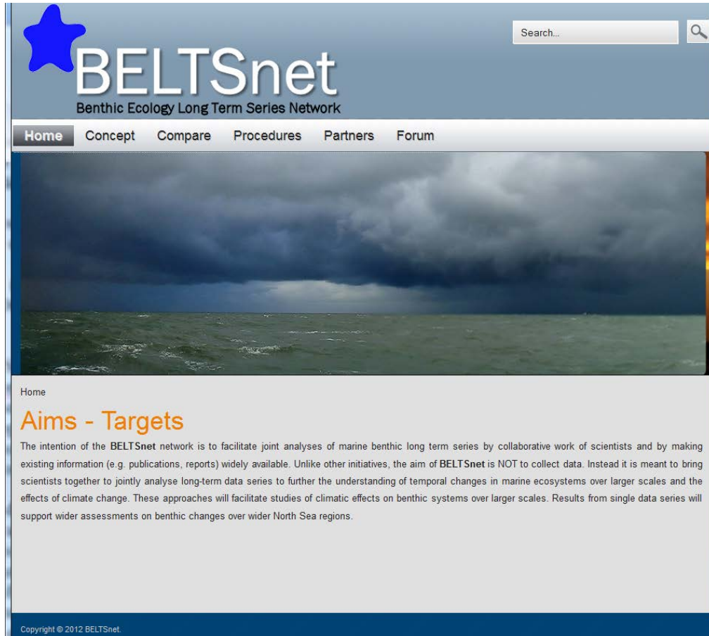
Figure 1. Screenshot of the BELTSnet homepage.

A meta-database structure, based on EML (Ecological Metadata Language) was suggested to avoid difficulties with different file formats.