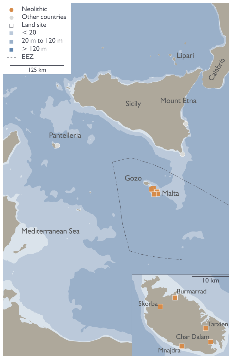
Fig. 17.1 Sites and geographical areas mentioned in the text. The 120 m depth contour is roughly equivalent to the coastline when sea level was at its lowest at the Last Glacial Maximum, while the 20 m contour represents a time somewhat prior to the currently known earliest traces of human activity on Malta. Drawing by Moritz Mennenga

ture that is best known for its spectacular ‘temples’ built of large worked and decorated stones (Evans 1971; Pace 1996; Ugolini 2012) (Fig. 17.2). At least 26 such megalithic monuments have been discovered, and UNESCO has declared the surviving structures as a World Heritage Site. Many of them are located in prominent positions that overlook natural harbours and have commanding views over the sea. Since the sea level of that period was approximately the