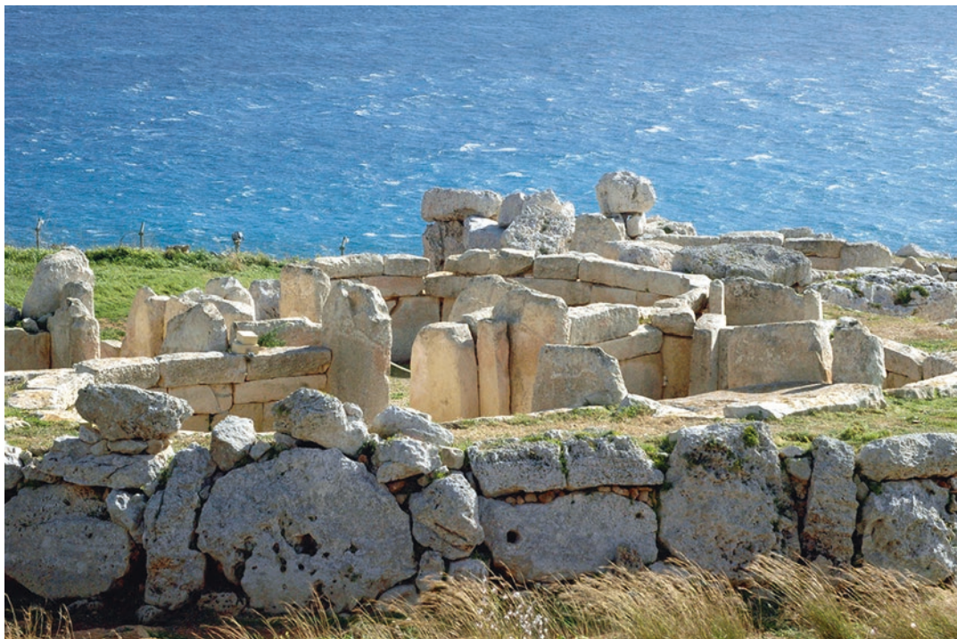
Fig. 17.2 The Mnajdra Temples built close to the cliff edge looking towards the sea.

materials, for instance, obsidian from both Lipari and Pantelleria, at distances of 159 km and 204 km, respectively (see also Castagnino Berlinghieri et al., this volume). Imports of red ochre, flint and pumice are also represented in the archaeological record of this time. Likewise, miniature axes found in Malta are made from various rocks originating from Calabria in the southern Italian mainland and from Mount Etna on Sicily (Trump 2002, p. 38–41). The presence of a few ‘exotic’ ceramic sherds confirms trade in finished goods originating from Sicily (Trump 2002, p. 211).