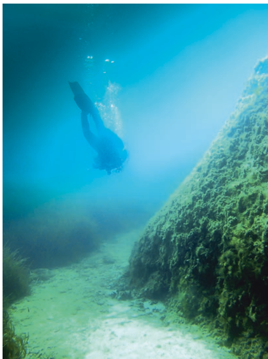
Fig. 17.4 Posidonia oceanica vegetation in different stages of development. The thick mass of vegetation to the right, known as a matte, is approximately 6 m in height, concealing any archaeological material that may be present on the seabed.

Malta has a long tradition of underwater archaeology focused on more recent millennia, primarily remains of ancient shipwrecks as well as other remains datable to the historical period (Azzopardi and Gambin 2012). Systematic searches for submerged Stone Age sites have not yet been attempted. However, the reconstructed topography of the submerged coastal zone during this period shows plains and rivers that may have been conducive to human settlement (Fig. 17.3). Today, these areas are covered by thick marine sediments as well as by dense mattes of Posidonia oceanica (Fig. 17.4). This cover of Posidonia