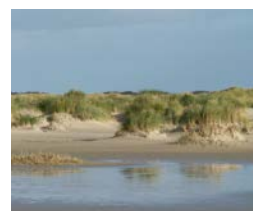
Examples of current Dutch and Belgian dune research.