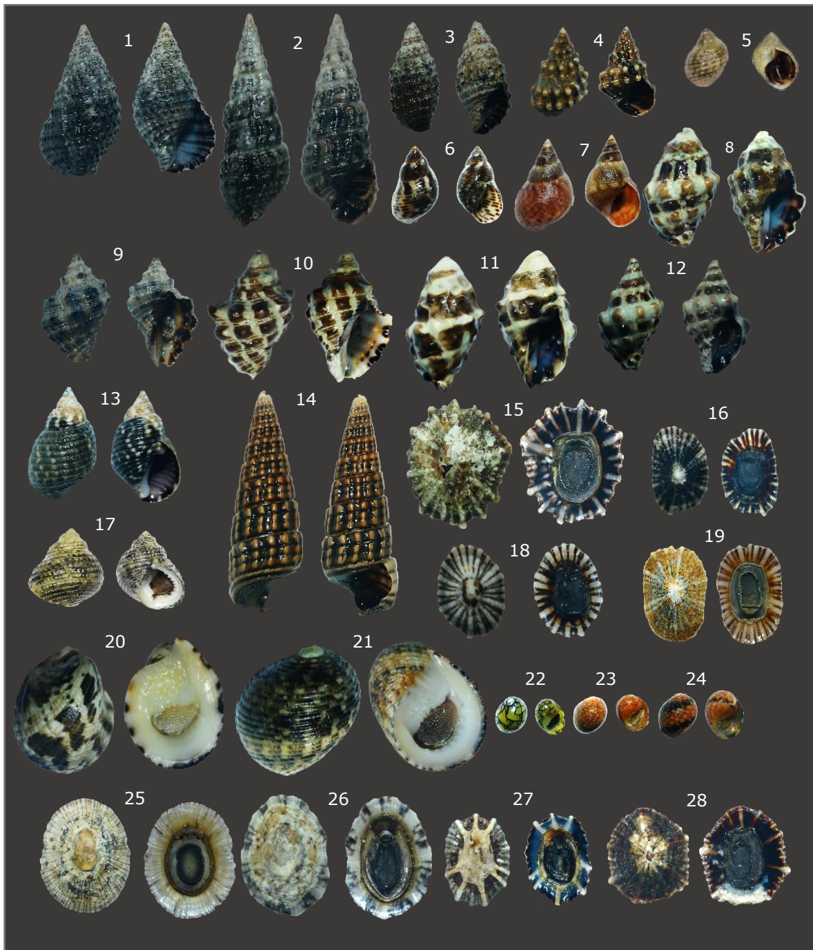
Figure 3. Apertural and abapertural of marine gastropods of Tanjung Jara and Teluk Bidara. (1) Batillaria sp., 17 mm; (2) Batillaria sordida , 9 mm; (3) Batillaria zonalis , 12 mm; (4) Echinolittorina malaccana , 5 mm; (5) Echinolittorina vidua , 6 mm; (6) Littoraria strigata , 6 mm; (7) Littoraria undulata , 10 mm; (8) Thais sp., 16 mm; (9) Indothais rufotincta , 9 mm; (10) Reishia bitubercularis , 16 mm; (11) Semiricinula fusca , 15 mm; (12) Tenguella musiva , 13 mm; (13) Planaxis sulcatus , 14 mm; (14) Pirenella cingulata , 14 mm; (15) Siphonaria atra , 5 mm; (16) Siphonaria guamensis , 3 mm; (17) Monodonta labio , 23 mm; (18) Siphonaria hispida , 3 mm; (19) Siphonaria sp., 12 mm; (20) Nerita albicilla , 20 mm; (21) Nerita chamaeleon , 19 mm; (22) Clithon oualaniense , 4 mm; (23) Clithon faba , 5 mm; (24) Clithon pulchellum , 8 mm; (25) Cellana enneagona , 5 mm; (26) Cellana radiata , 4 mm; (27) Patelloida saccharina , 4 mm, and (28) Patelloida sp., 4 mm. Measurements indicates shell length (mm).