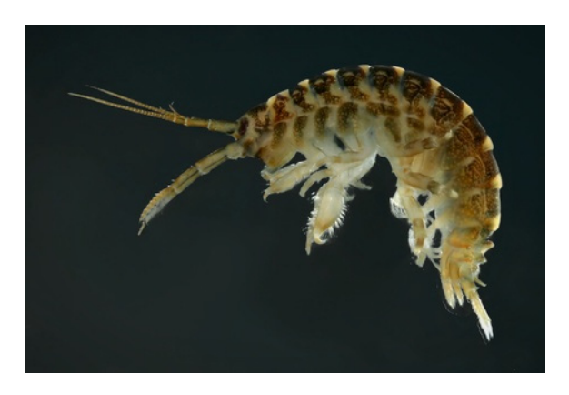
Figure 2. Live specimen of Dikerogammarus villosus.