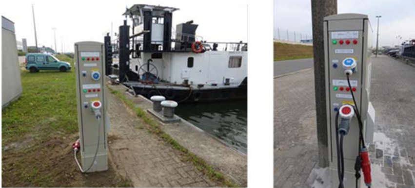
Figure 3. Shore power installation in Port of Antwerp