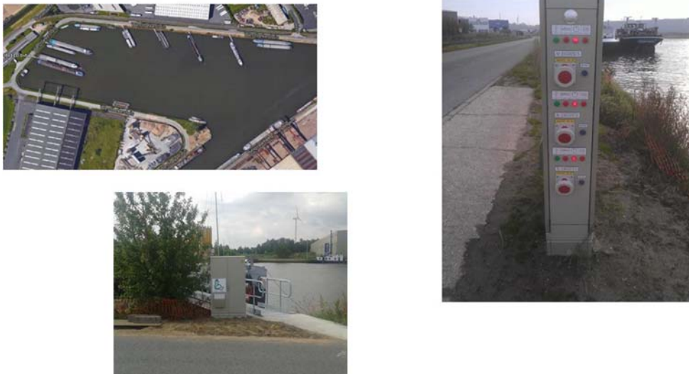
Figure 4. Shore power installations in the waiting port of Evergem

In October 2015, Waterwegen en Zeekanaal NV has finalised the installation of 3x2 shore power boxes in Port of Evergem (Figure 4). The Port of Evergem is now equipped with a total of 32 connection points with three types of connections: 16A 1Phase, 32A 3Phase and 63A 3Phase.