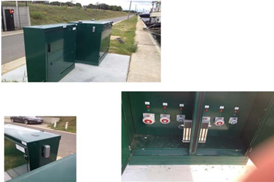
Figure 5. Shore power installations in the waiting port of Wijnegem

16 shore power boxes were built and installed at the location "Albertkanaal/Wachthaven Wijnegem" (Figure 5), with a total of 32 connection points with three types of connections: 16A 1Phase, 32A 3Phase and 63A 3Phase.