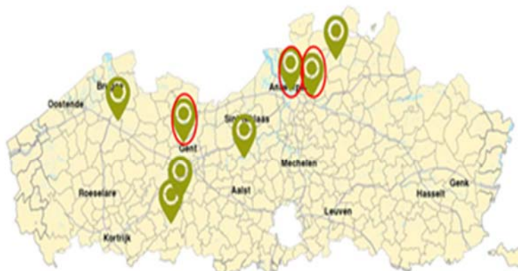
Figure 2. Locations of the pilot shore power installation

A pilot project (activities 3 and 4) consisted of installing and adapting shore power boxes in three locations that were connected to the Central Management System (being developed as part of activity 2). The locations are located in Port of Antwerp, the waiting port of Evergem and the waiting port of Wijnegem (Figure 2).