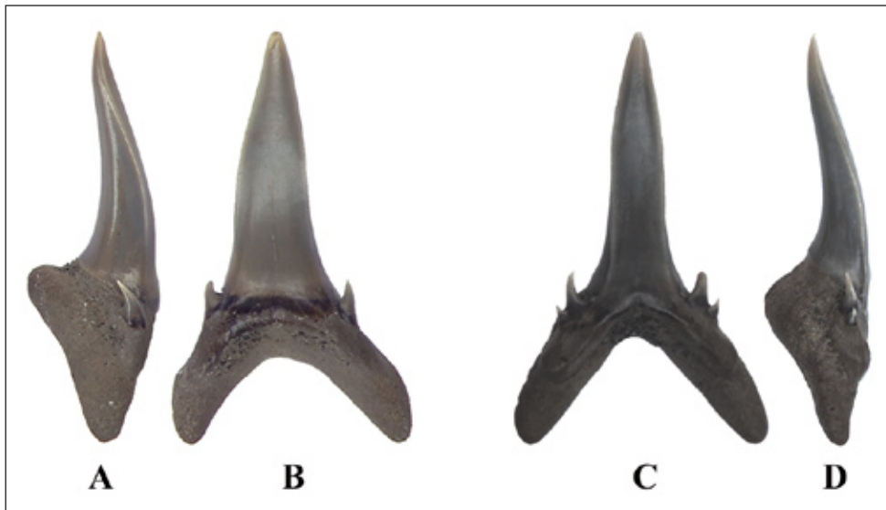
Figure 4. Neotype IRSNB P.8800 (A-B) and paraneotype IRSNB P.8801 (C-D). Lateral (A, D) and labial (B, C) views.

lingually directed, but the crown-tip is recurved labially. The crown surface is smooth. The cutting edges reach from apex to almost the base. A sharp, lingually curved cusplet flanks the principal cusp at each side. The root has a strong and high lingual protuberance with a well developed nutrient groove. Both root lobes are mesio-distally compressed.