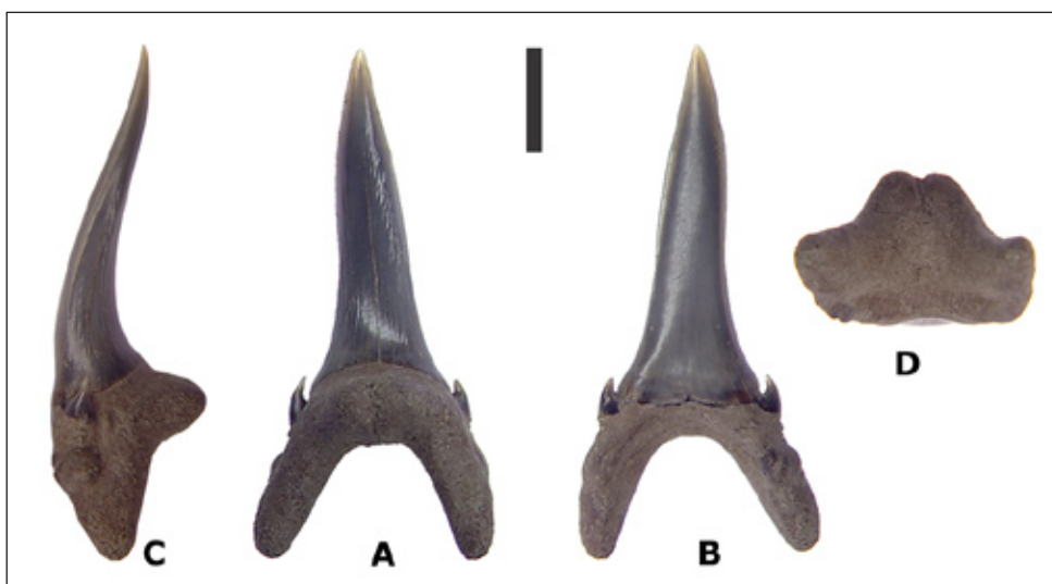
Figure 6. Carcharias acutissimus/taurus , second lower anterior tooth (LA2). Middle Miocene, Antwerpen Sands Member; Berchem (scale bar = 5 mm). Lingual (A), labial (B), lateral (C) and basal (D) views.

The holotype in Le Hon, figured in natural size, measures 29 mm in height, which significantly differs from Carcharias reticulatus (Probst, 1879). The largest specimen of the syntypes of C. reticulatus illustrated by Probst (1879, pl. 2, fig. 27), a second lower anterior tooth,