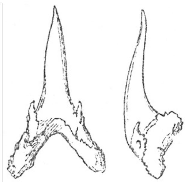
Figure 3. Holotype of Carcharias vorax (Le Hon, 1871).

Le Hon (1871, p. 5) figured a single lower anterior tooth that he described as Lamna (Odontaspis) vorax , found in the "Pliocene" of the Antwerp region (Fig. 3). By the short description of the single figured tooth, Lamna (Odontaspis)