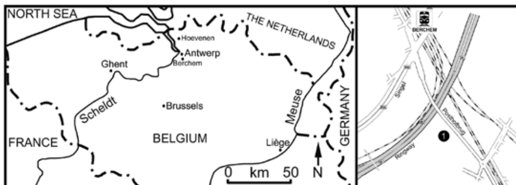
Figure 1. Location of the study area near Antwerp in northern Belgium. The Posthofbrug outcrop (1) was located near the railway station of Berchem (N 51° 11' 38" – E 4° 26' 04").

Numerous odontaspidid teeth were recovered from the Miocene and the transgressive base of the Pliocene, that have been attributed by authors to Carcharias vorax (Le Hon, 1871), Carcharias acutissimus (Agassiz, 1843) and Carcharias reticulatus (Probst, 1879). Reinecke et al. (2005, p. 21) separated Carcharias reticulatus from Carcharias acutissimus , but synonymized the former with the Oligocene species Carcharias gustrowensis (Winkler, 1875). However, the Middle Miocene representatives of