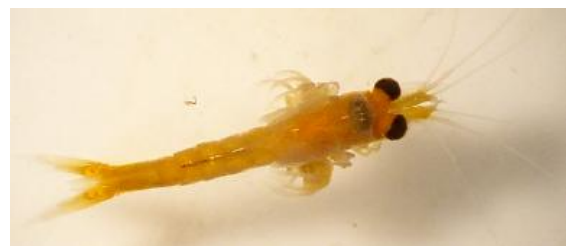
Figure 2. Dorsal view of Hemimysis anomala