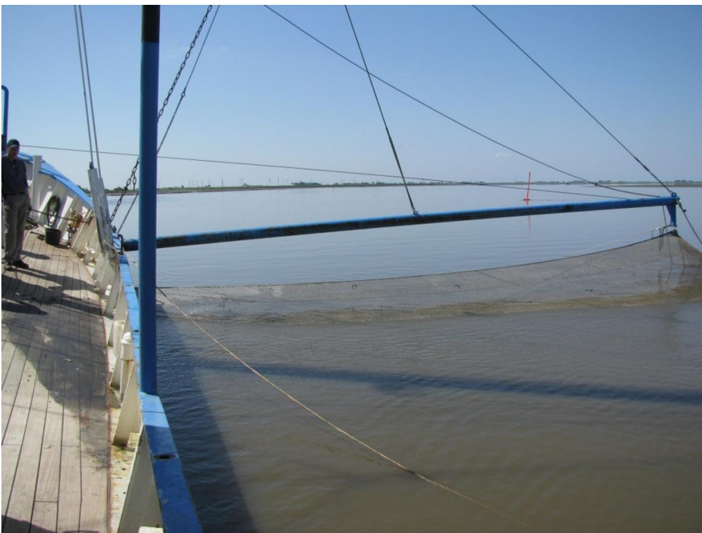
Figure 8. Stow net fishery on the Ems estuary.