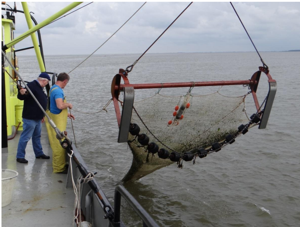
Figure 5. The 3 m beam trawl deployed in the Dutch Demersal Fish Survey (Photo:

The beam trawl surveys (Figure 5, Figure 6) revealed a general decline among marine juvenile species since the 1980s, uniformly across all areas ( Annex 2 ). As an exception tub gurnard increased in nearly all areas since 2000. Trends in estuarine resident species were much more variable, both between areas and species ( for trend plots see Annex 3 ).