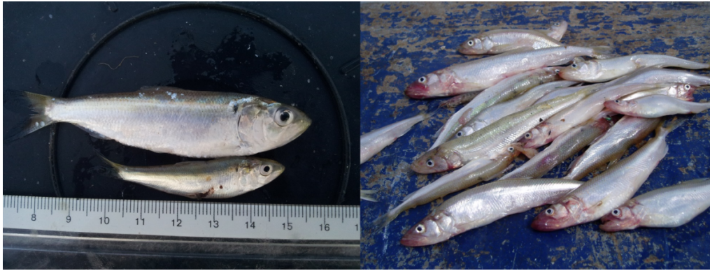
Figure 10. Left (A): Twaité shad ( Alosa fallax ) adult (above) and juvenile (below) caught in the Weser; Right (B): Smelt ( Osmerus eperlanus ) caught in the Weser (Photos: S. Schulze, Bioconsult).