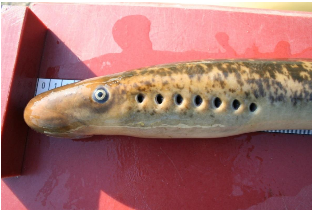
Figure 9. Sea lamprey (Photo: Ingrid Tulp, IMARES).

Pilchard was only caught in the fykes. Catches were highly variable and trends were uncertain in both time-series.