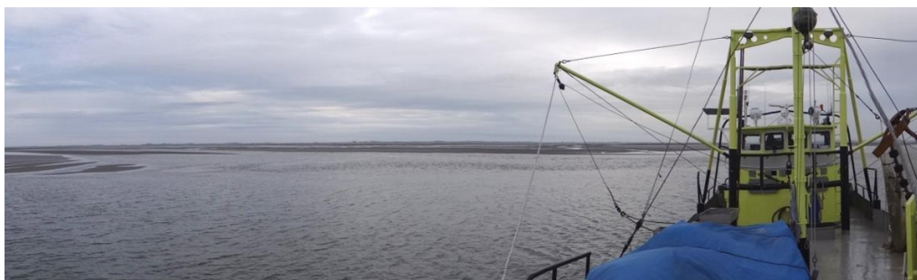
Figure 1. Fishing boat in the Wadden Sea (Photo: Ingrid Tulp, IMARES).

Fish species occurring in the Wadden Sea have been listed previously (e.g., Witte and Zijlstra, 1978; Bolle et al., 2009). In this report, focus is set on the status and trends of selected fish species, typically found in the Wadden Sea. Given that the trilateral fish targets are described in an abstract manner and, therefore, cannot be evaluated quantitatively, this QSR-contribution will be restricted to describing and classifying trends in a selection of species and functional groups.