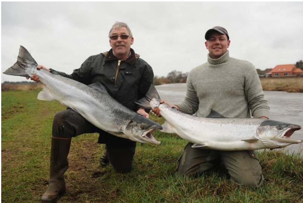
Figure 11. Salmons ( Salmo salar , approx. 18 kg each) caught on the Varde å in April.

The European eel is globally threatened, also in the Wadden Sea area. The recruitment of glass eels is only a few percent of earlier levels. A small increase/recovery was noted in 2011-2015 on monitoring stations in Denmark, but the one station in the Wadden Sea area has shown no such trend. The population status is very low and there is no sign of substantial recovery. The outmigration of silver eels from the Ribe å is quite low (less than four tonnes per year) and has shown no clear trend.