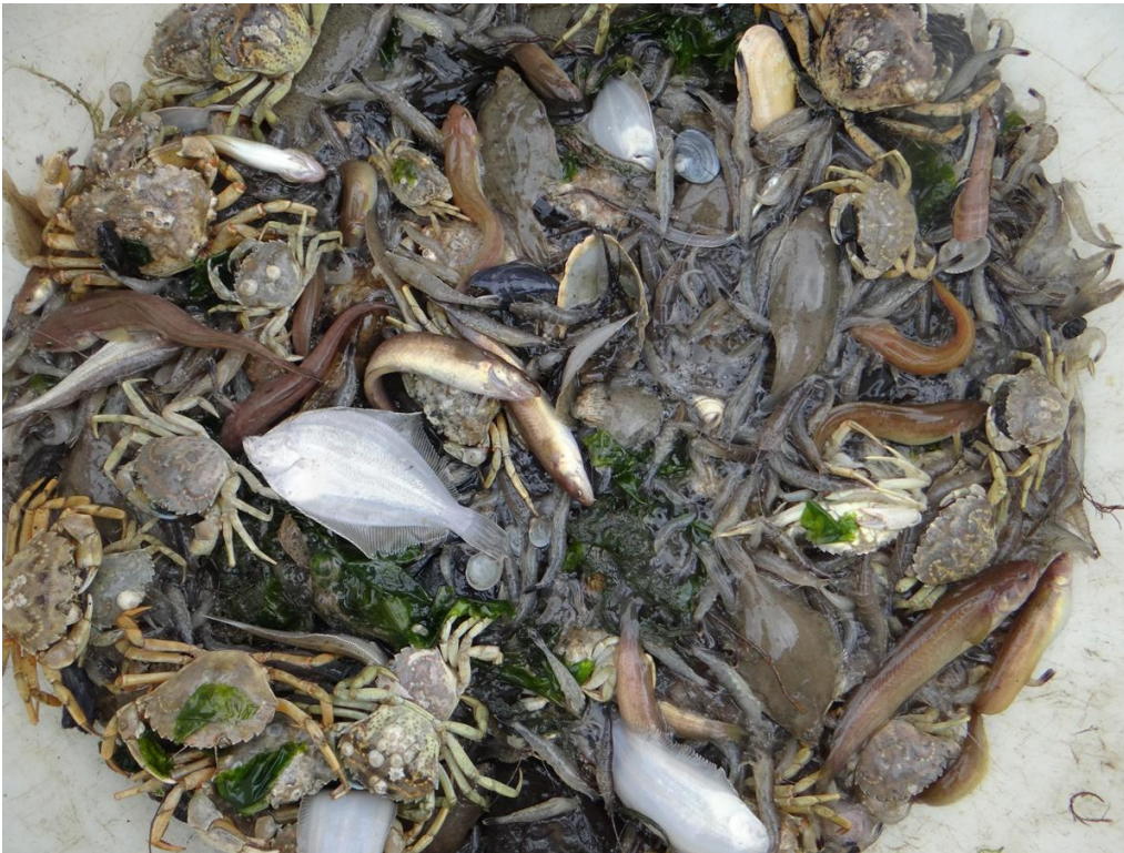
Figure 6. A beam trawl catch in the western Dutch Wadden Sea (Photo: Ingrid Tulp, IMARES).