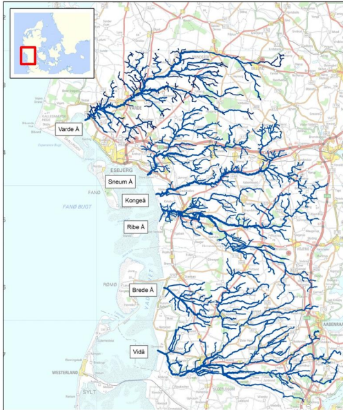
Figure 4. Map of the main Danish Wadden Sea rivers (names in boxes, Å means river in Danish) included in the Danish freshwater monitoring programmes.