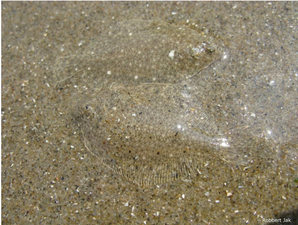
Figure 2. Two young plaice hiding on top of the sediment.