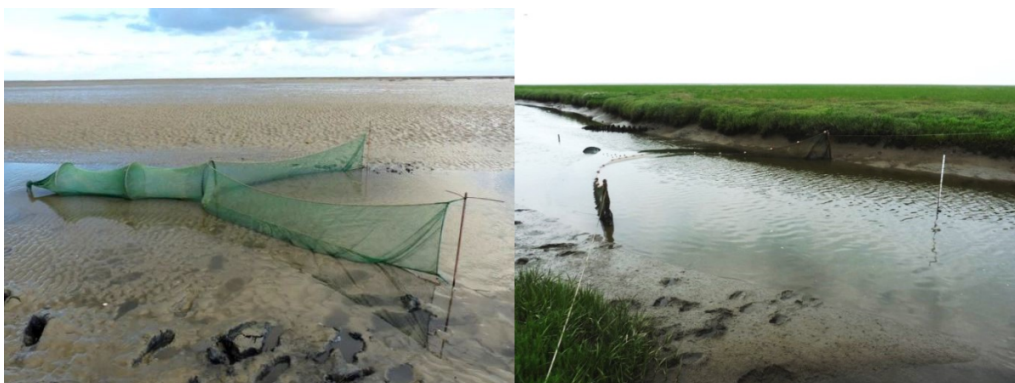
Figure 12. Left (A): Fyke nets positioned in creeks draining an intertidal Pacific oyster reef (Kaiserbalje, Lower Saxon Wadden Sea); Right (B): A salt marsh in Dieksanderkoog

These dedicated research projects on specific habitats provided useful insights into the importance of salt marsh creeks and oyster beds for several fish species, including rarer (endangered) species that may go unnoticed in the standard surveys. The results of such projects deliver basic knowledge on seasonal habitat requirements of fish, such as spawning and nursery habitat. This knowledge is needed in order to evaluate the value of different habitats in the life cycle of Wadden Sea fish species.