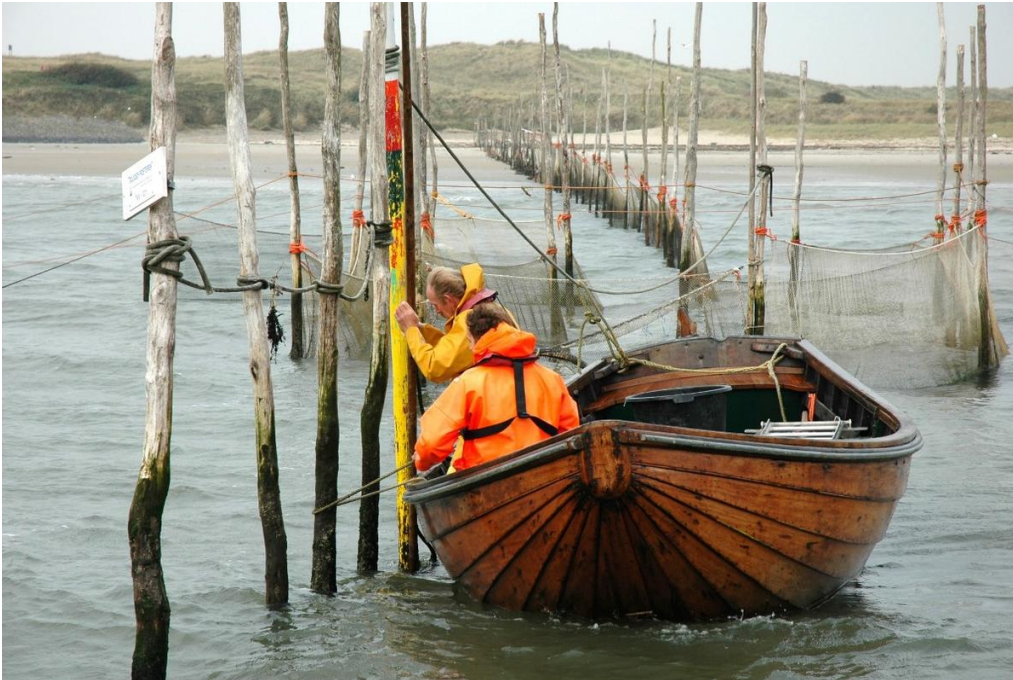
Figure 7. Daily emptying of the NIOZ fyke at the southern tip of Texel in the western Dutch Wadden Sea.