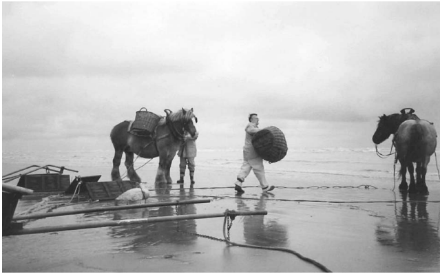
Figure 7. Baskets are attached to both sides of saddle as seagull watches ready to pick into the haul.

crafts accommodation, traditions have been kept alive in Oostduinkerke. True the shrimp fishing on horseback has principally a folkloric cachet left, but it is nevertheless a colourful event well appreciated by the tourist and seasonal residents and a bonanza for the establishments serving breakfast! The question might logically be raised 'Why did this type of artisanal fishing maintain itself on only one beach of Belgium?' The reason might well be that, for some obscure administrative motive, Oostduinkerke remained the only resort where no breakwaters were installed, thus no interference exists to the free passage of horses and trailing nets.