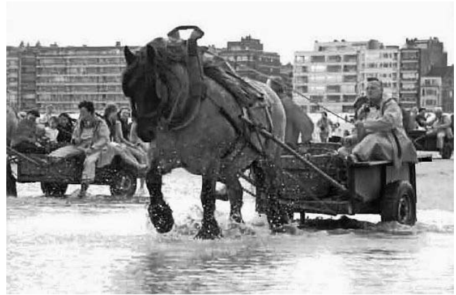
Figure 13. Horses and fishermen providing joy ride on their day off to small and big (Photo Koksijde Tourist Office).

The shrimps are gathered in the baskets, the net is washed out, the cart hooked on, and the trip ‘back home’ started (Figures 11 and 12). There, the hard-worked horse is fed oats. The catch is washed again, sand is removed as much as possible before the shrimp are thrown in the broiling brine. Once boiled, the shrimps are no longer grey or brown, but red. The brine is poured off, and the small prawns are ready for the market.