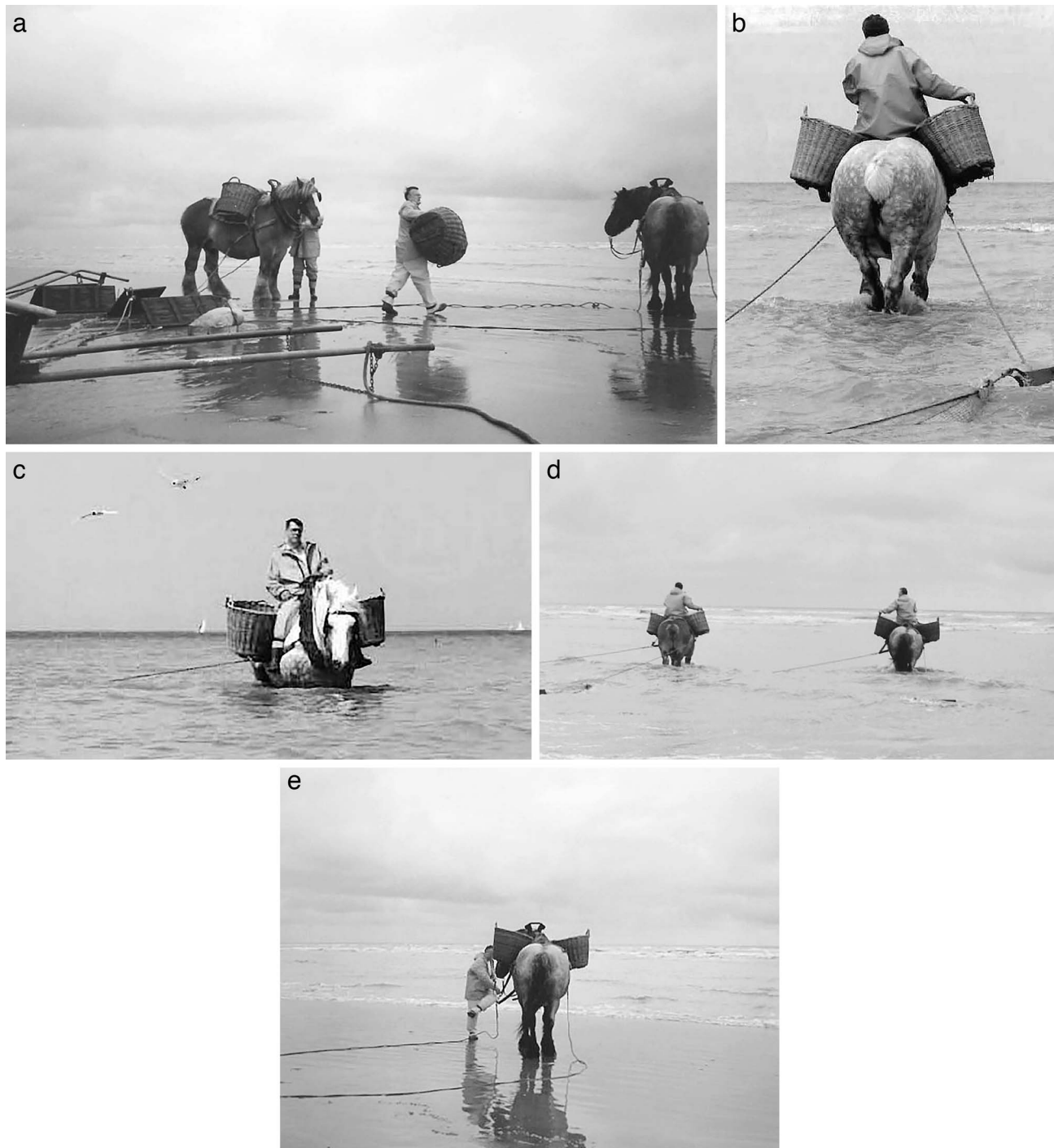
Figure 10. (a) Nets, baskets: preparing horses to start fishing (Photo Koksijde Tourist Office). (b) View of 'dredge-net' (backside) (Photo Koksijde Tourist Office) (c) Front view of net cable and maximum depth of fishing (Photo Koksijde Tourist Office). (d) Starting operations. (e) Ready to go!

net afloat. When the horse and its rider reach the low tide water line, the cart is unhooked, tools set aside, and the baskets affixed to the saddle. Fishing time lasts generally 3 hours, during which one follows low tide.