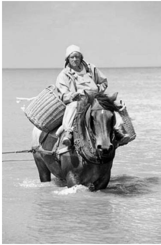
Figure 11. Heading back for shore.