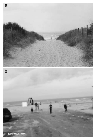
Figure 5. (a) Oostduinkerke. Schipgat former inlet. (b) Fig. 5b Schipgat (literal translation: ship's hole) access to the sea (Note: Metal structure in far background is work of art that has no relation to former function of the sea inlet nor to current access path of shrimp fishermen to beach and surf).

The economy of the Flanders' maritime plain has, however, undergone major changes in the historical period. Hardly is one aware today that Flemings of the sleepy resort of Wenduine, which prided itself as Princess-of-Beaches resort, were once reputable whale hunters whose tradition lives on in the 'Flemish Islands', now called the Azores (Charlier, 2004a)? It is equally difficult to visualize most of the generous dozen of towns lined up along the coast as fishing communities and, except for three or four among them, all stranding 6 harbours. Gone are the boats carrying initials C, O, B, W, etc. Gone too are the narrow houses huddled behind the protective sea dikes (Van Bladel, 1930). Gone even are the fancy Victorian-type sea promenade villas—occasionally referred to as Art Nouveau or Belle Époque—that Nazi-occupation forces cemented together during WW II (1940–1945) to form part of the 'impregnable' Atlantik-Wall . Wiped out for as long as a