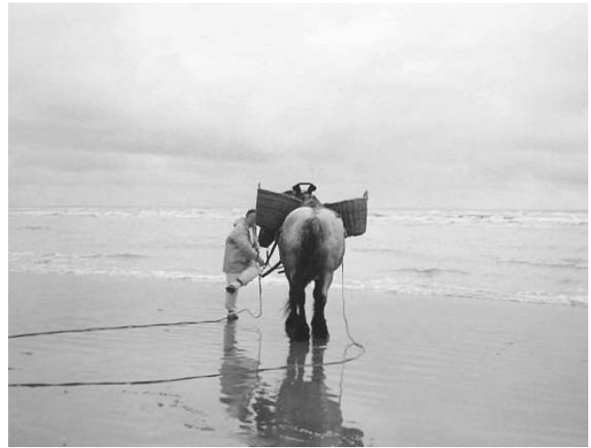
Figure 8. Shrimp fisherman mounting his horse after baskets have been fitted to wooden saddle; chains are attached to the 'net' (Photo Koksijde Tourist Office).

metres long that slides over the sand and lifts the shrimps into the net. Mules were preferred but have disappeared from the scene. The nets are kept open horizontally by two side boards, a chain drags on the sand, and floaters keep the upper side of the