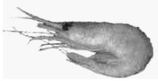
Figure 14. Crangon crangon .

Down these succulent dishes with a dry white wine and you will never forget the horseback shrimp fishermen. A shrimp omelette is not to be looked askance at either!