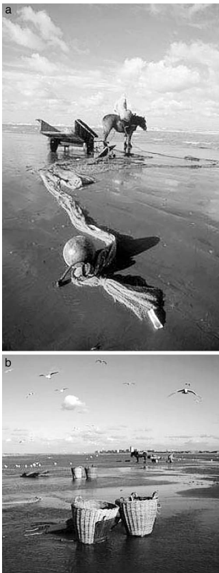
Figure 12. Gathering tools and catch.

Overfishing of the crustacean—not just locally—has rendered this type of fishing hardly profitable, and the second stage of the process—cooking in vats or drums—is done at the fisherman’s home in a brine of his own concoction; it is part of the ‘show’ only in the peak tourist season (July–August). Crangon crangon (Figure 14) is Noordzeegarnaal to the Flemings and Crevette de la mer du Nord or crevette grise [from the original Picard language word chevrette ] to the French. Why grey shrimp is known to the Anglophones (who often designate the crustacean as prawns) and as Brown Shrimp is unclear. But there are still more than enough grey shrimp to offer in the shore eateries the celebrated shrimp tomato (see Appendix) and the shrimp croquettes (once a ‘popular’ dish, now at premium prices) or, in the gastronomic fish restaurants the sole ostendaise (similar to the sole dieppoise of the French). 10