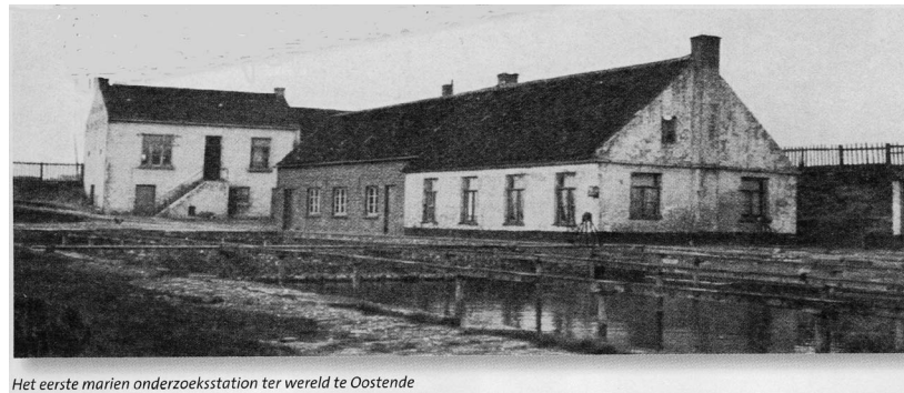
Figure 3. The world's first marine biology research station, erected in 1843 in Ostend [Oostende, Ostende] Belgium. Though fish and oysters study were the principal concern of this institute, founded by professor P.-J. Van Beneden, shrimps were not ignored. This is an archive photo as the station was completely wiped out to widen Ostend's port access.