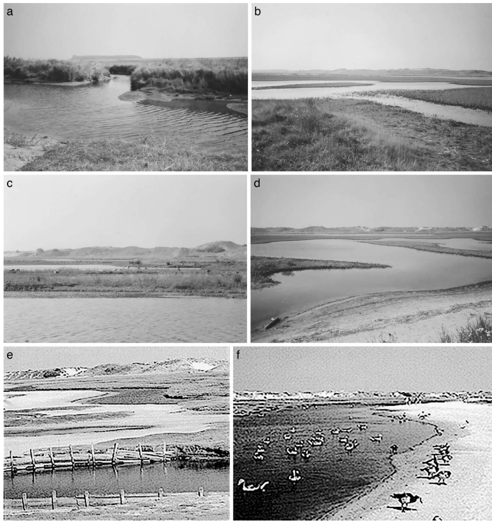
Figure 6. (a) The wet lands around the former Zwin Inlet. (b) Zwin inlet. (c) Zwin inlet as tide rolls in. (d) Zwin Inlet near high tide. (e) The Zwin channel (2010). (f) The Zwin ornithological reserve.

century are the remnants of the very first marine station in the world. 7 And vanished were the oyster breeding beds nearby (so appreciated by the British), until their timid 'resurrection' during the last lustre. Gone also are the ornate thalassotherapy facilities and mineral water springs of Ostende-Thermal (La Barre, s.d.; Charlier and Chaîneux, 2009).