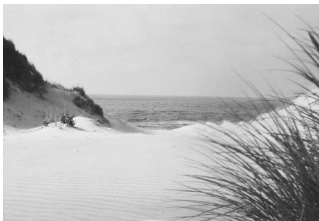
Figure 4. Oostduinkerke, Schipgat close-up view. Access for horseback shrimp fishermen to beach.

Monks have sprinkled the land behind the string of dunes with abbeys, some that left some timid traces, some that even maintained themselves to the present. They tilled the land with the help of oxen and sturdy horses and got a solid reputation as the producers of the three Bs: butter, bread, and beer, whose quality are never doubted. Excavations by archaeologists made in 2010 unearthed the oldest medieval town of the shore area: Leffinge, near Ostend, was a human settlement established after the Gallo-Roman Period on a manmade butte (compare to the Netherlandish 'terpen' ) in the 8th century. The area must have been important since a church dating to the 10th century was found.