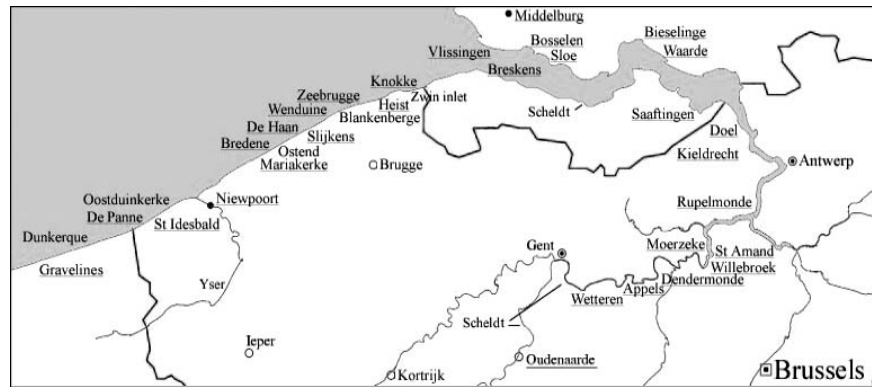
Figure 1. Location map Belgian coast. Scale: approximately 67 km from De Panne to Knokke. Oostduinkerke and Schipgat former inlet, lower left; Zwin inlet, upper left. Gravelines former inlet, in France, extreme lower left.