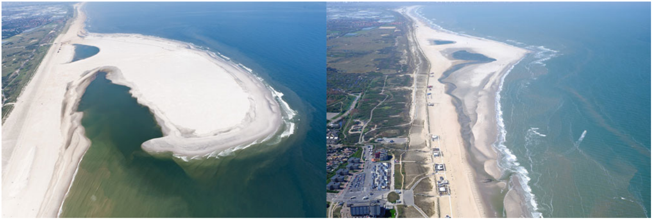
Fig. 18.3 Mega-nourishment ‘Delfland Sand Motor’. After completion in July 2011 ( left ) and in May 2015 ( right ) after reshaping