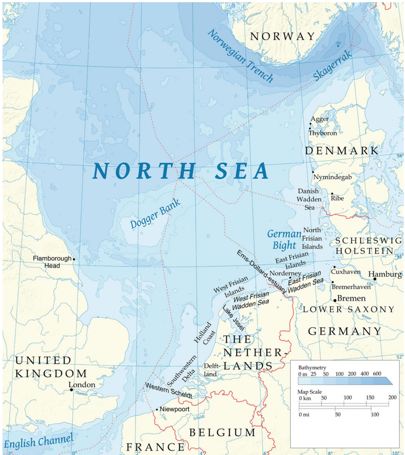
Fig. 18.2 North Sea Basin and surrounding countries (base map: http://de.wikipedia.org/wiki/Datei:North_Sea_map-en.png )