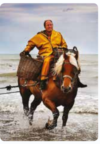
Oostduinkerke, Belgium