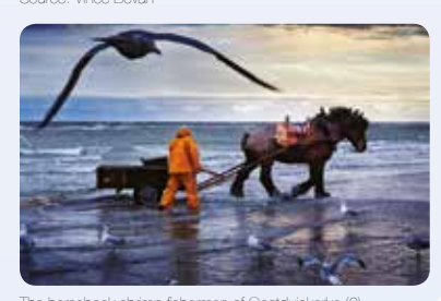
I ne norseback snrimp tisnermen of