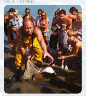
he horseback shrimp tishermen of Uostduinkerke