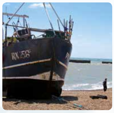
Hastings, UK

oulogne, France