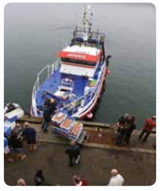
e Guilvinec, France – Source: GIFS Researcher Photography.