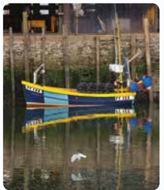
Looe, Cornwall, UK