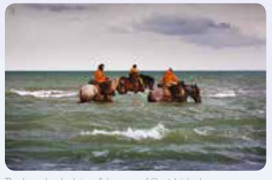
The horseback shrimp tishermen of