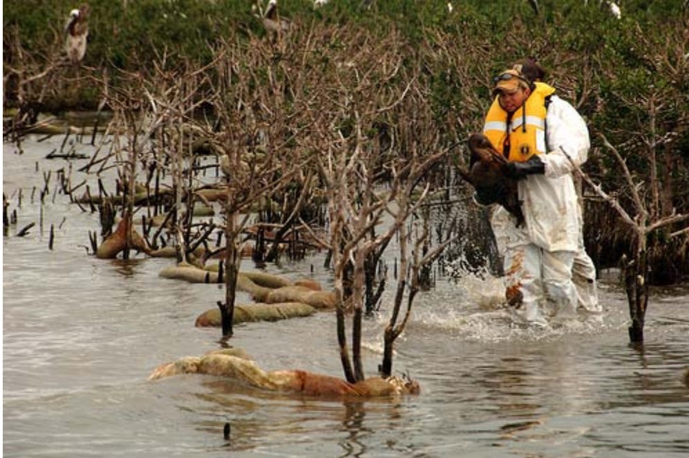
Deepwater Horizon Response Bird Rescue.