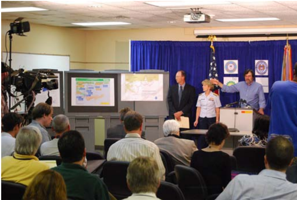
NOAA provides critical scientific information to the response effort dealing with the oil leak in the Gulf of Mexico.