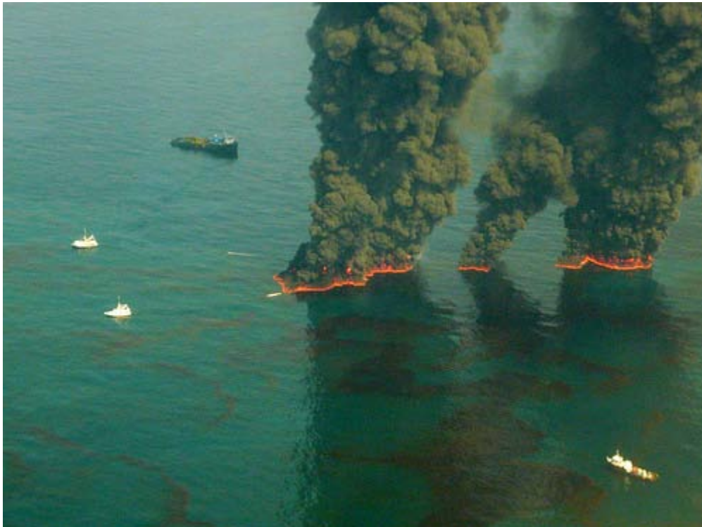
Aerial view of oil being burned from the Deepwater Horizon/BP incident, May 19, 2010.

Wikipedia. 2010. Deepwater Horizon Oil Spill . Online access: http://en.wikipedia.org/wiki/Deepwater_Horizon_oil_spill