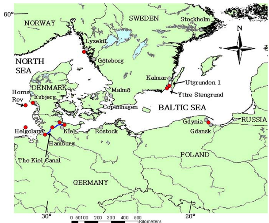
Fig. 1 Findings (dark/red circles) of Telmatogeton japonicus in the southern Baltic Sea and the adjacent part of the North Sea (Atlantic Ocean). The present study was done at Utgrunden 1. Important ports for shipping near the findings are indicated as light grey circles

While working within the project DOWNWInD ( Distant Offshore Windfarms with No Visual Impact in Deepwater ) surveying the fish community around the seven offshore windmills at the wind farm Utgrunden 1 in the southern Kalmar Strait of the Baltic Sea (Fig. 1), observations were made by M. H. Andersson in August 2007 of a frequent occurrence of a dark midge on the windmill foundations in the splash zone (Fig. 2). When returning in October the same year, three samples of the adult midge were recovered by a SCUBA diver swimming in the surface water using a small landing net. Several larvae and pupae of the midge were sampled from the splash zone (the water surface and 50 cm upwards) by the collector standing on a ladder connected to the wind turbine foundation, and samples were taken using a knife and tweezers. All organisms were stored in 70% alcohol for transportation and analysis. At the wind farm Yttre Stengrund 30 km south of Utgrunden (cf. Fig. 1), visual observations of larvae and flying adults of