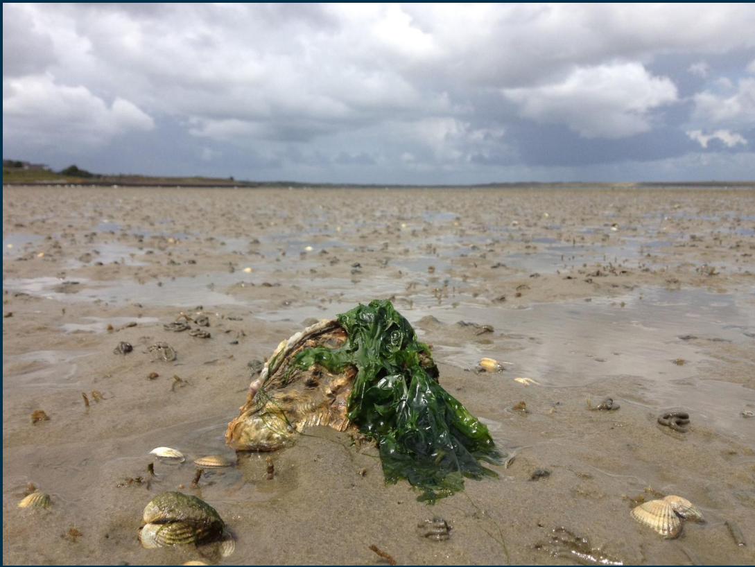
Oyster near Texel.